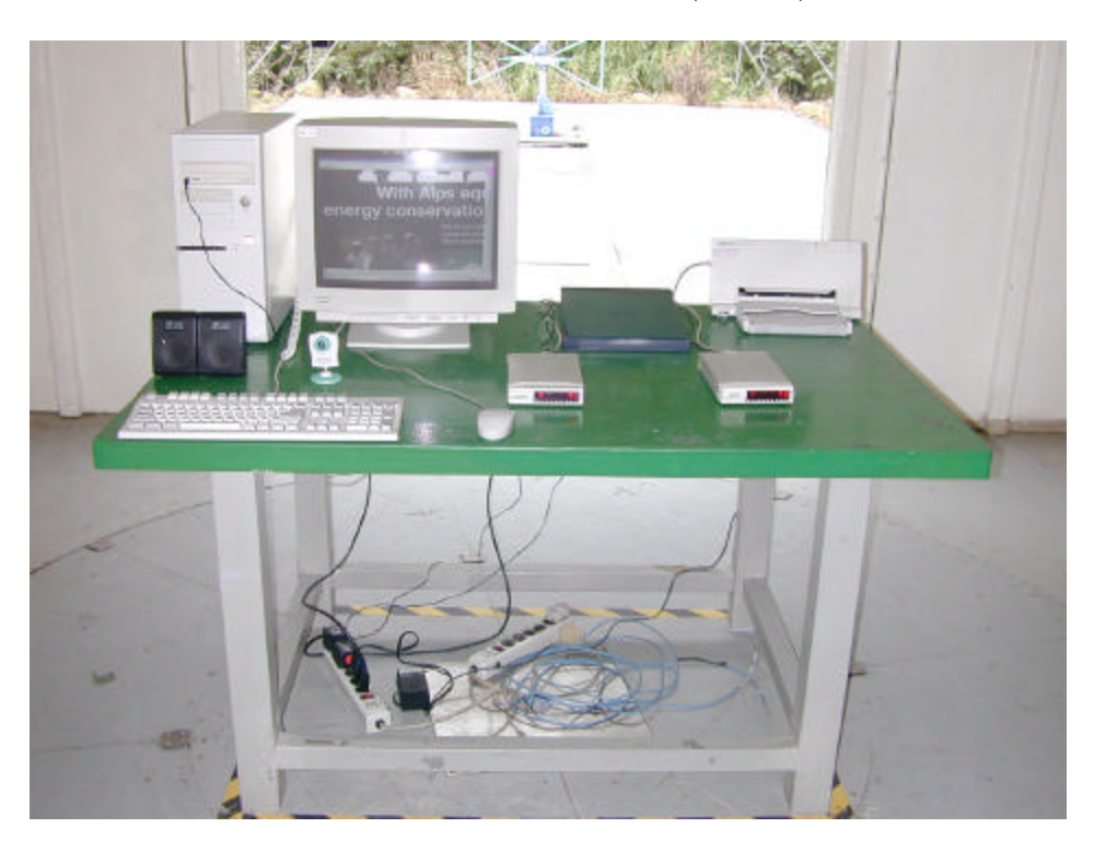
Back View of Radiated Test (Mode 1)