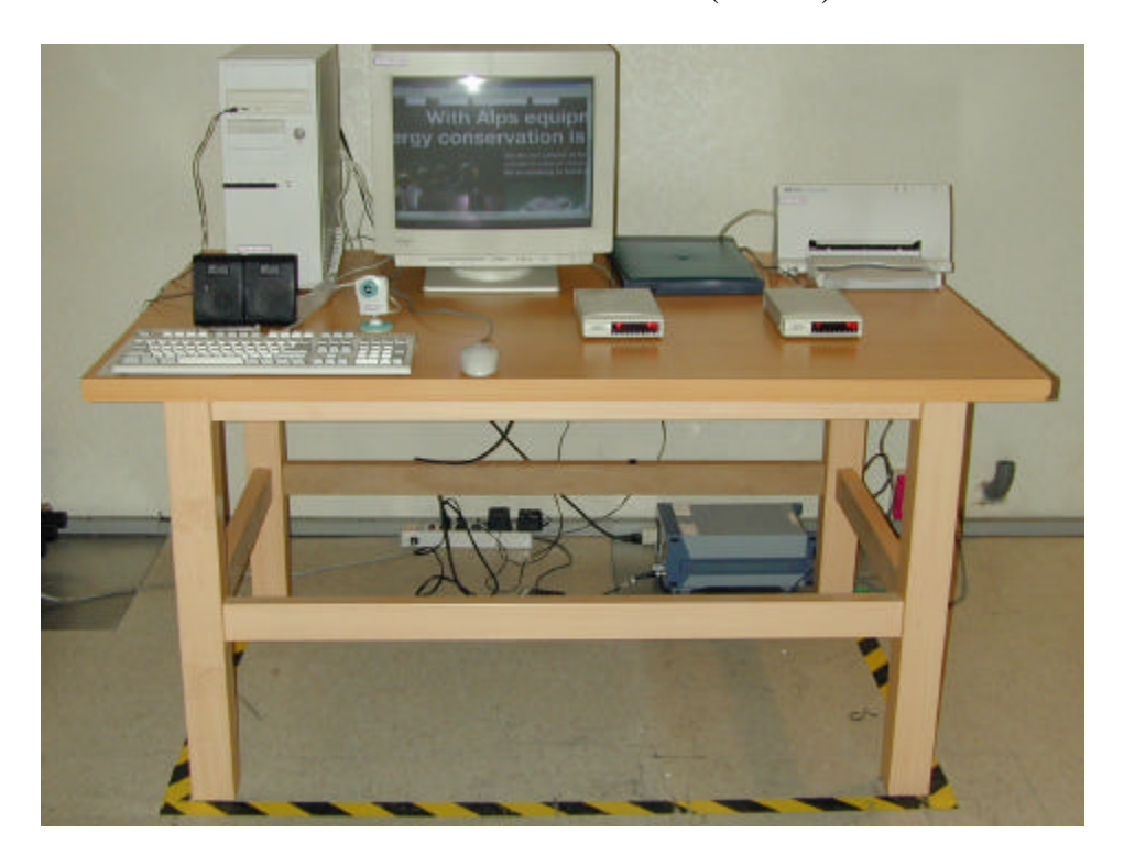
Back View of Conducted Test (Mode 1)