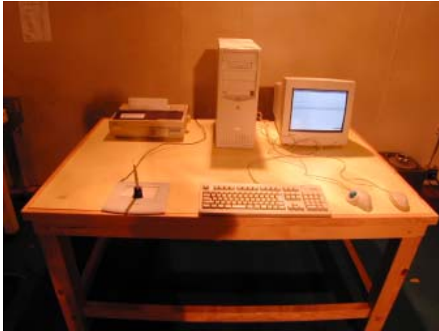
Photo 7.1 Setup with the Maximized RFI Voltage Emission Level