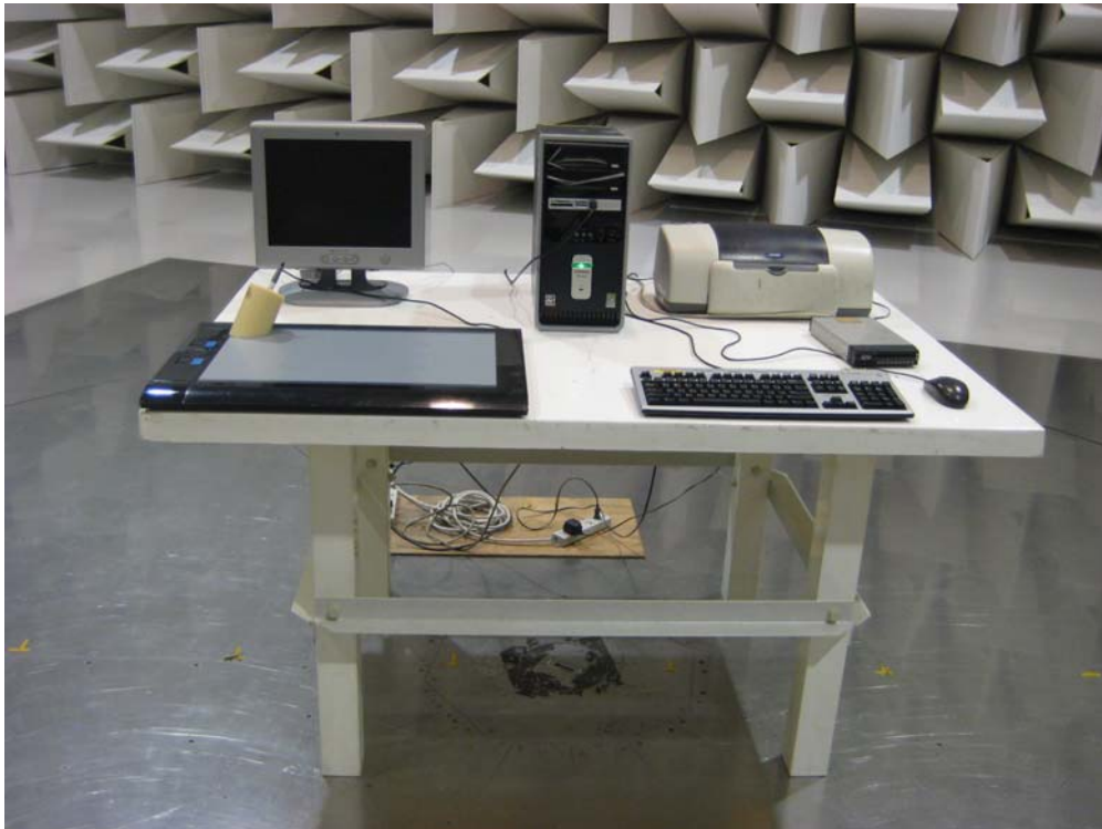
PTK-1240 / KP-300E ( Right-handed person )