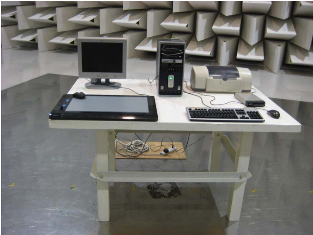
PTK-1240 / KC-100 ( Right-handed person )