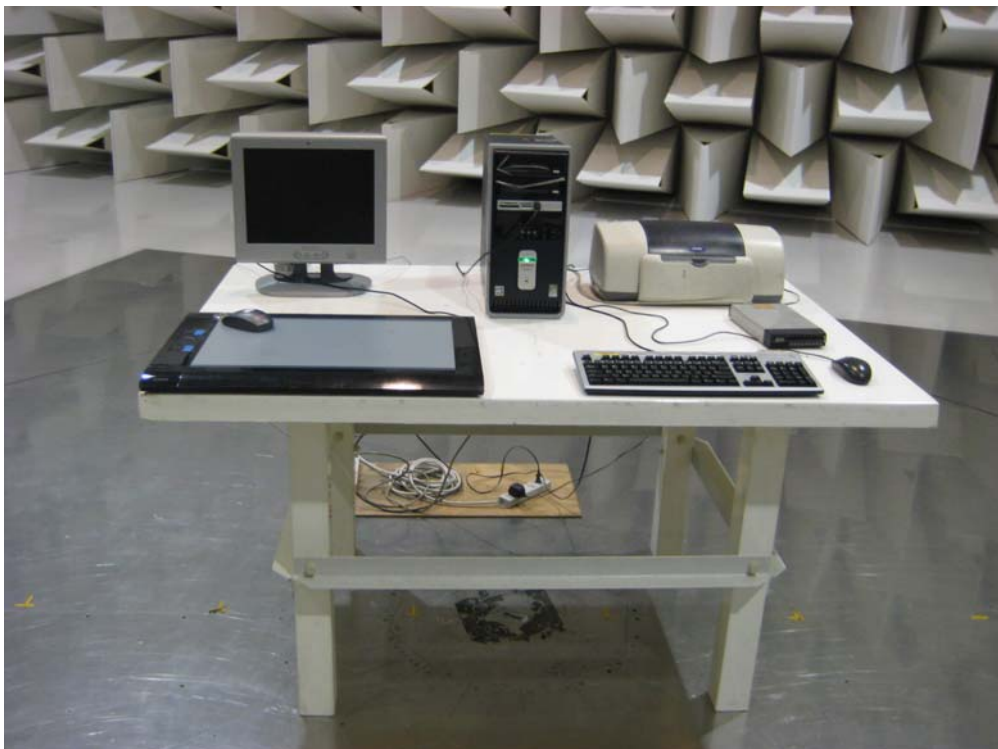
PTK-1240 / KC-210 ( Right-handed person )