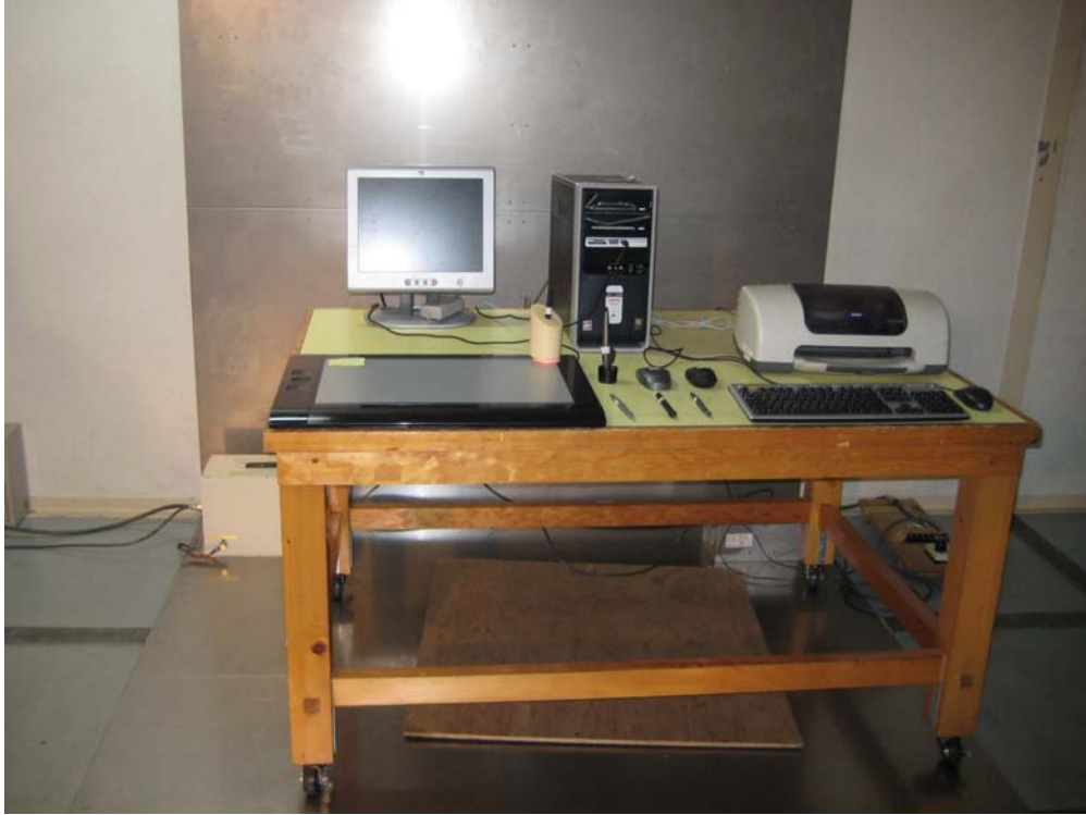
Photo 7.1 Setup with the Maximized RFI Voltage Emission Level