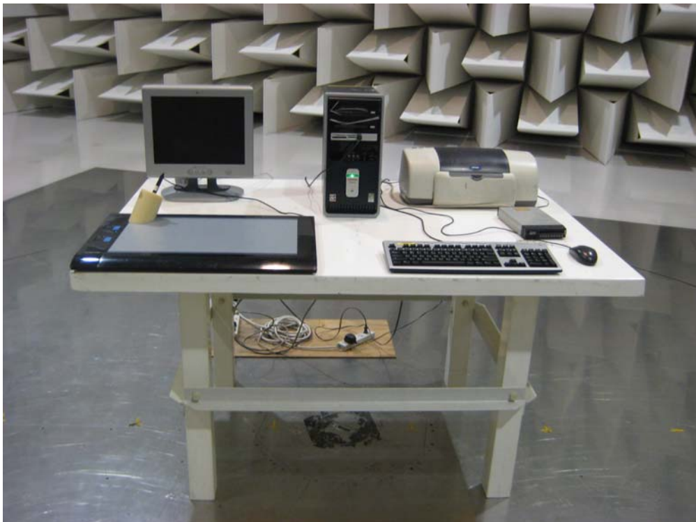
PTK-1240 / KP-701E ( Right-handed person )