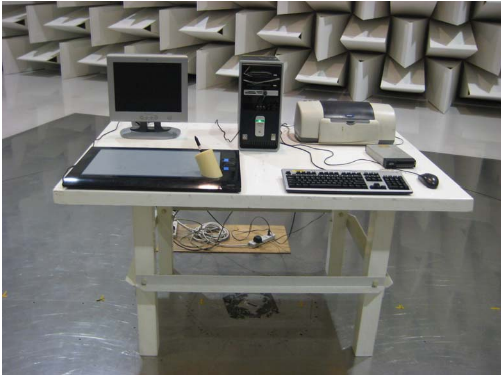
PTK-1240 / KP-501E ( Left-handed person )