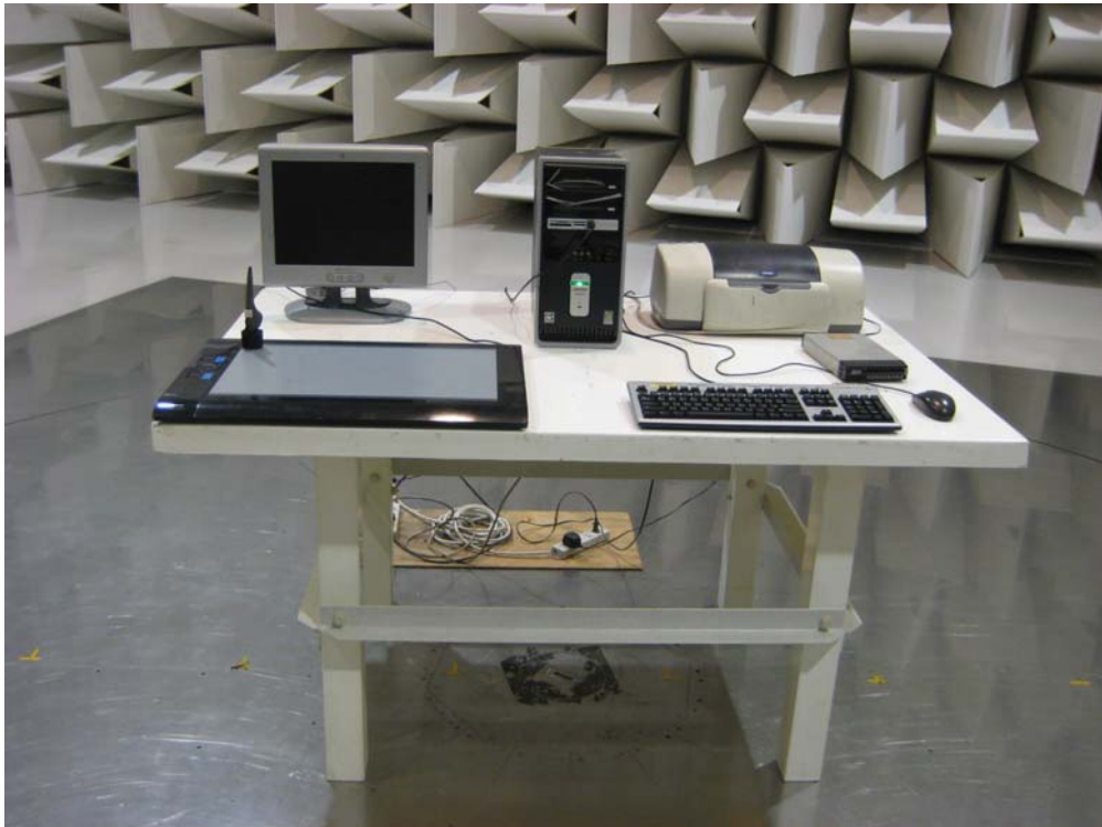
PTK-1240 / KP-400E ( Right-handed person )