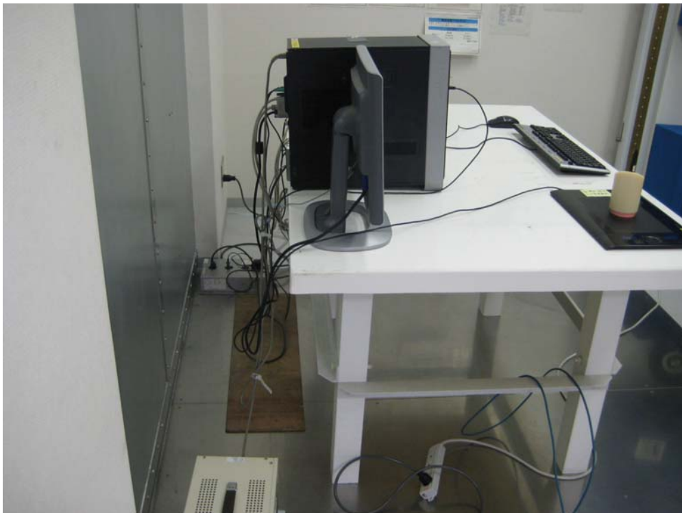
PTK-640 / KP-501E / STJ-276 (Right-handed)