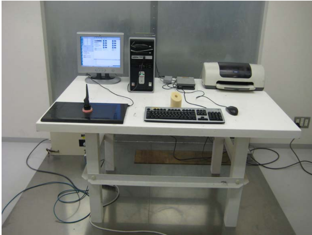
PTK-840 / KP-400E / STJ-276 (Right-handed)