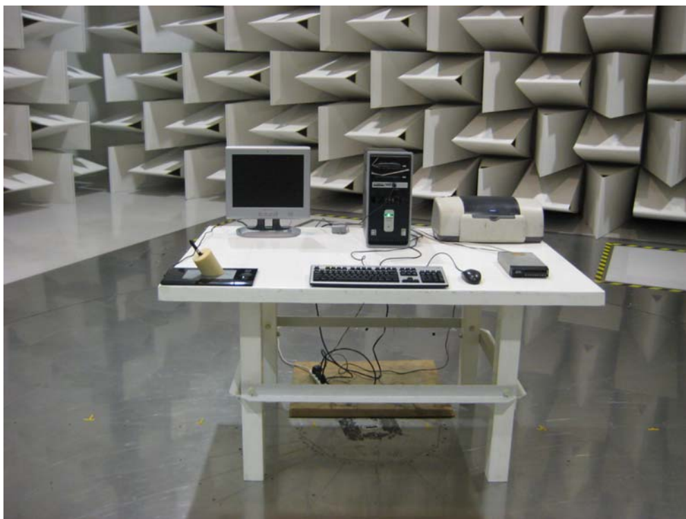
PTK-440 / KP-501E / STJ-277-02 (Left-handed)