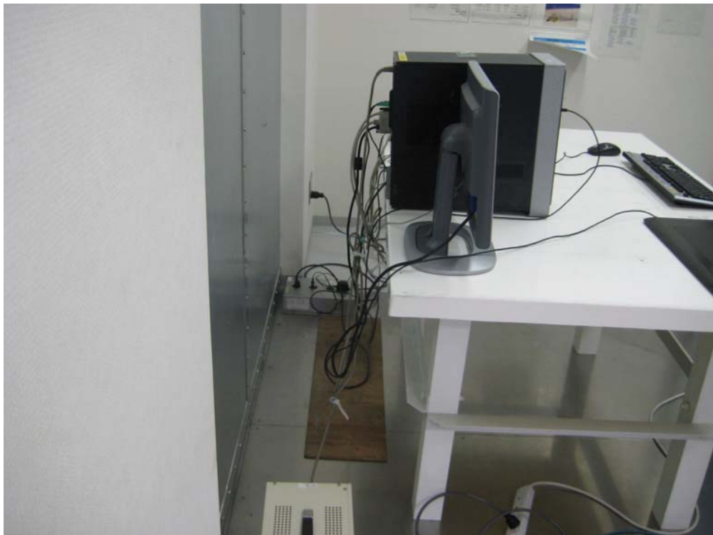
PTK-840 / KP-501E / STJ-276 (Right-handed)