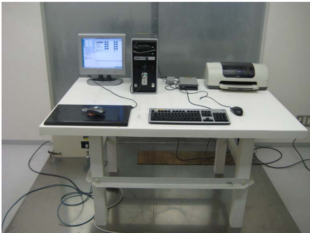
PTK-840 / KC-210 / STJ-276 (Right-handed)