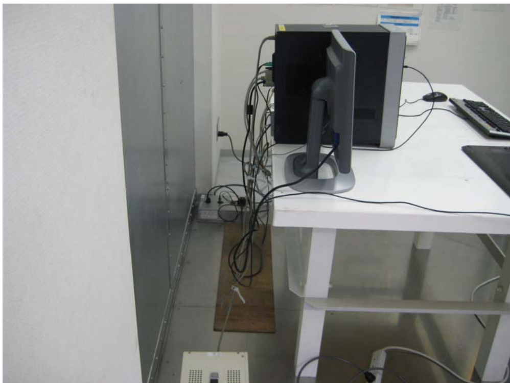
PTK-840 / KP-501E / STJ-276 (Left-handed)