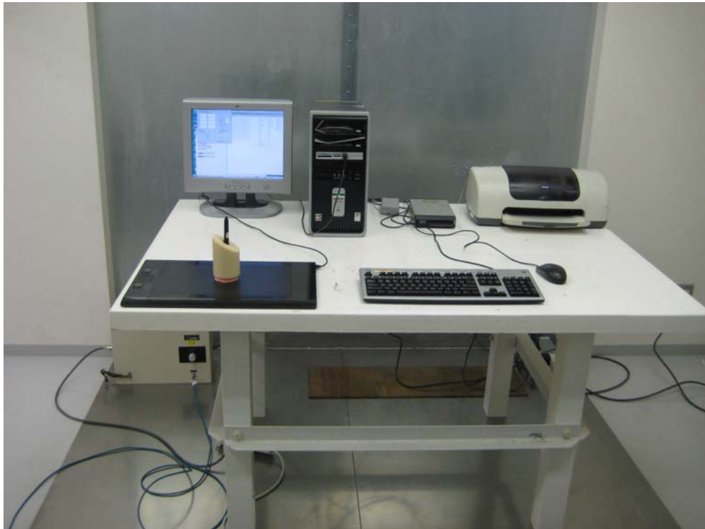
Photo 7.1c Setup with the Maximized Terminal Voltage Emission Level