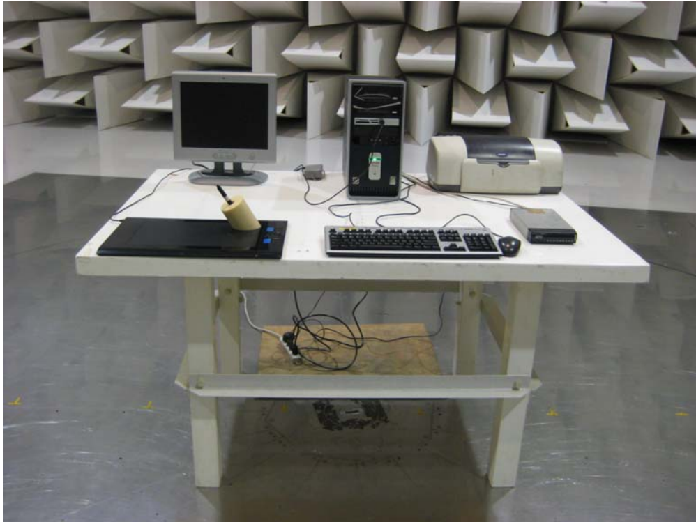
Photo 7.2j Setup with the Maximized RFI Field Strength Emission Level