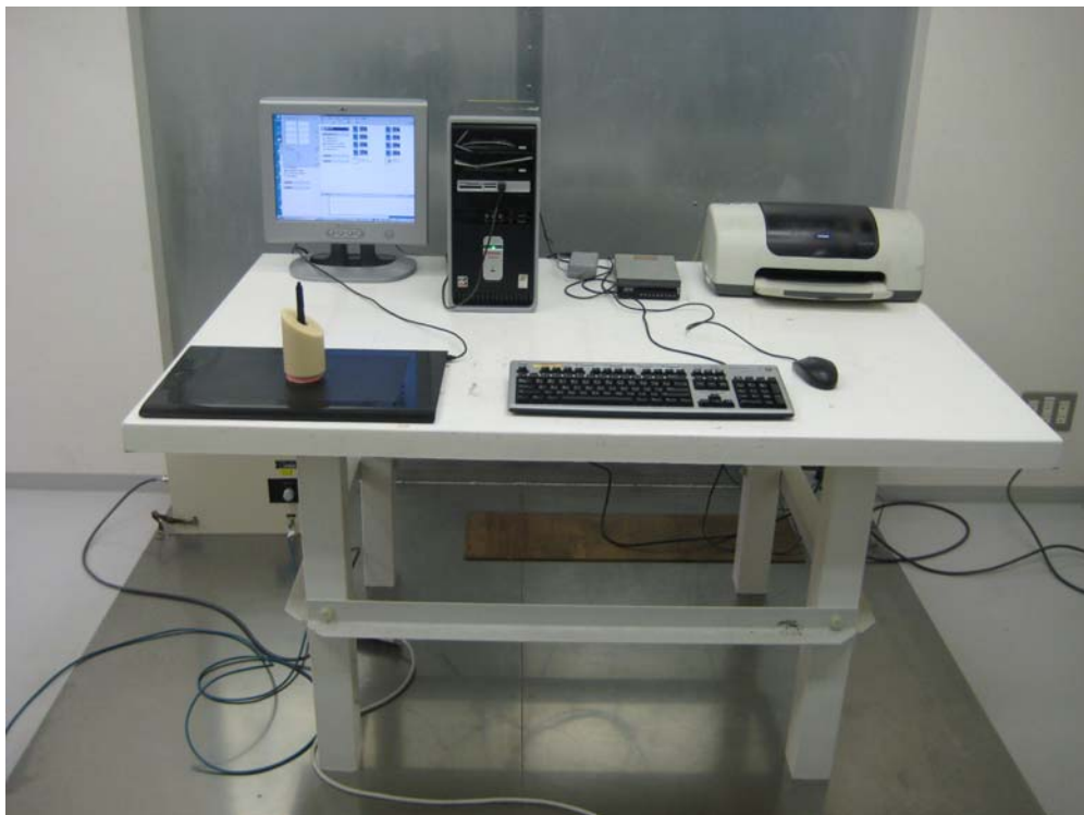
PTK-840 / KP-701E / STJ-276 (Right-handed)