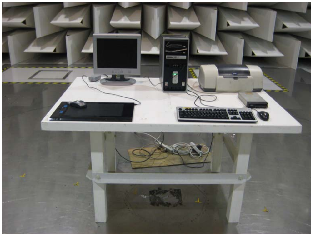
PTK-840 / KC-210 / STJ-276 (Right-handed)