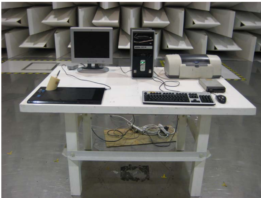
PTK-840 / KP-300E / STJ-276 (Right-handed)