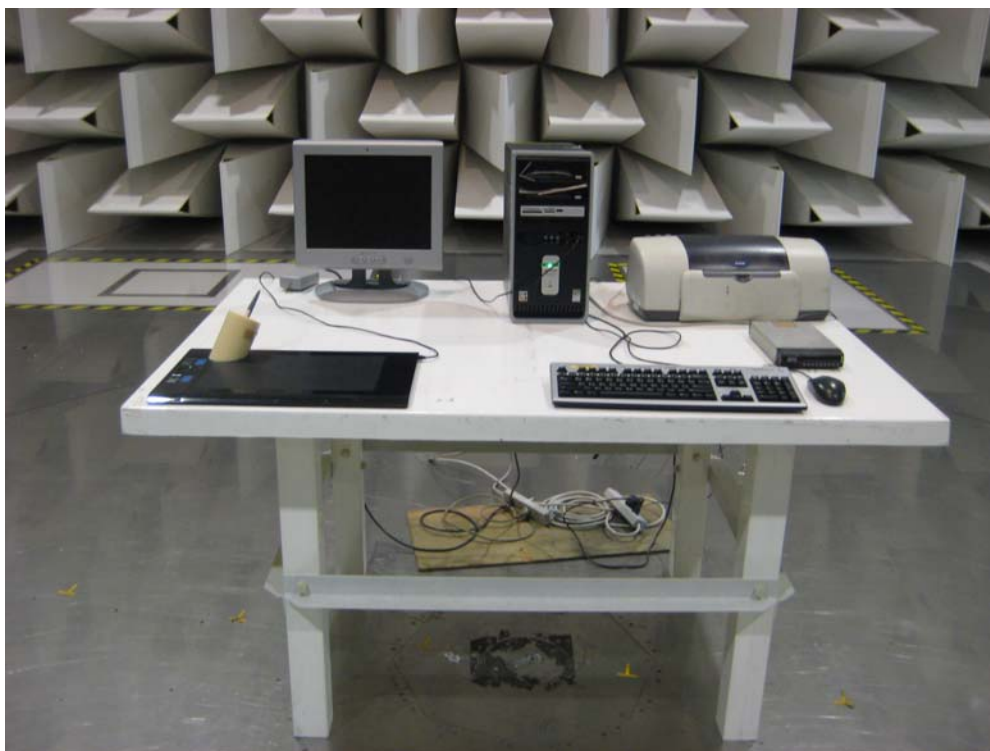
PTK-840 / KP-130 / STJ-276 (Right-handed)