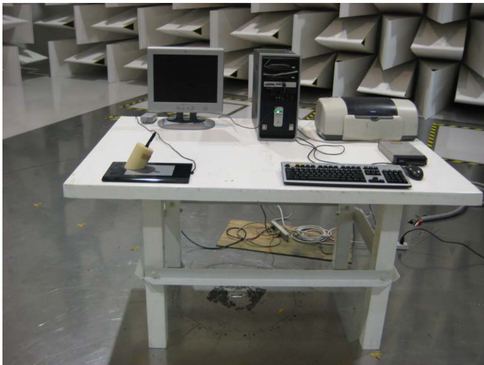
PTK-440 / KP-501E / STJ-277-01 (Right-handed)