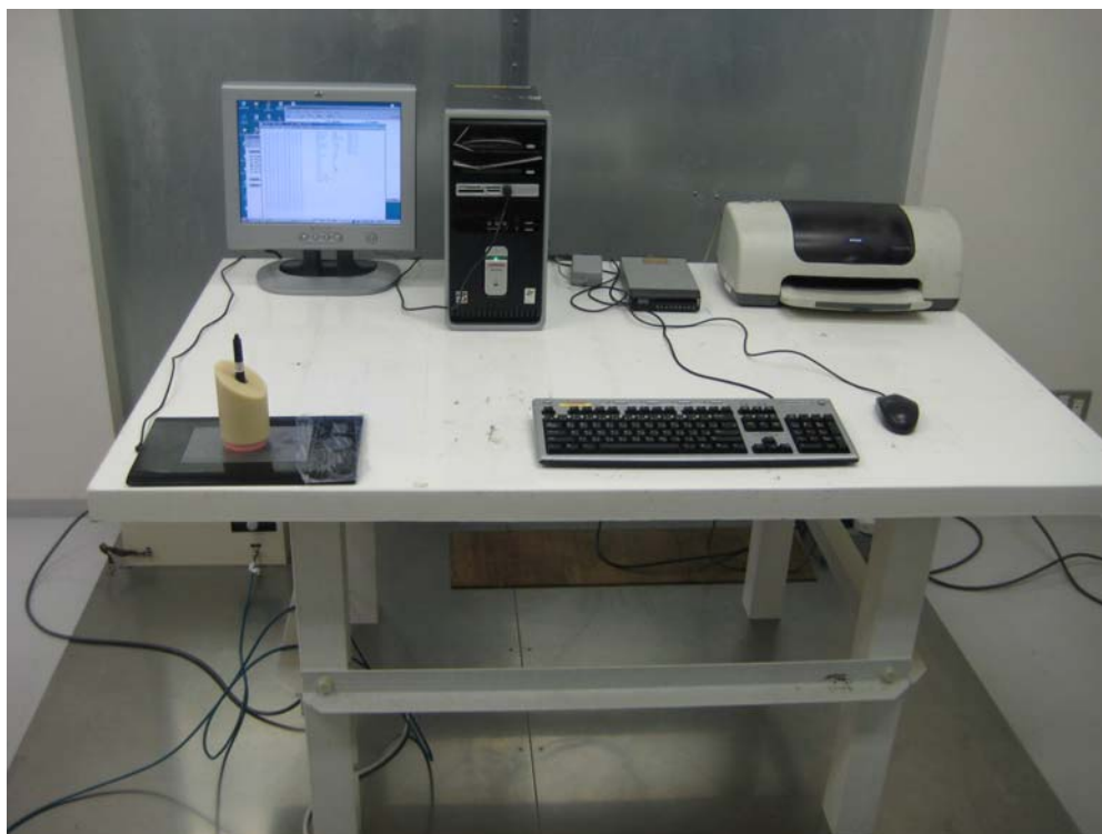
PTK-440 / KP-501E / STJ-277-02 (Left-handed)