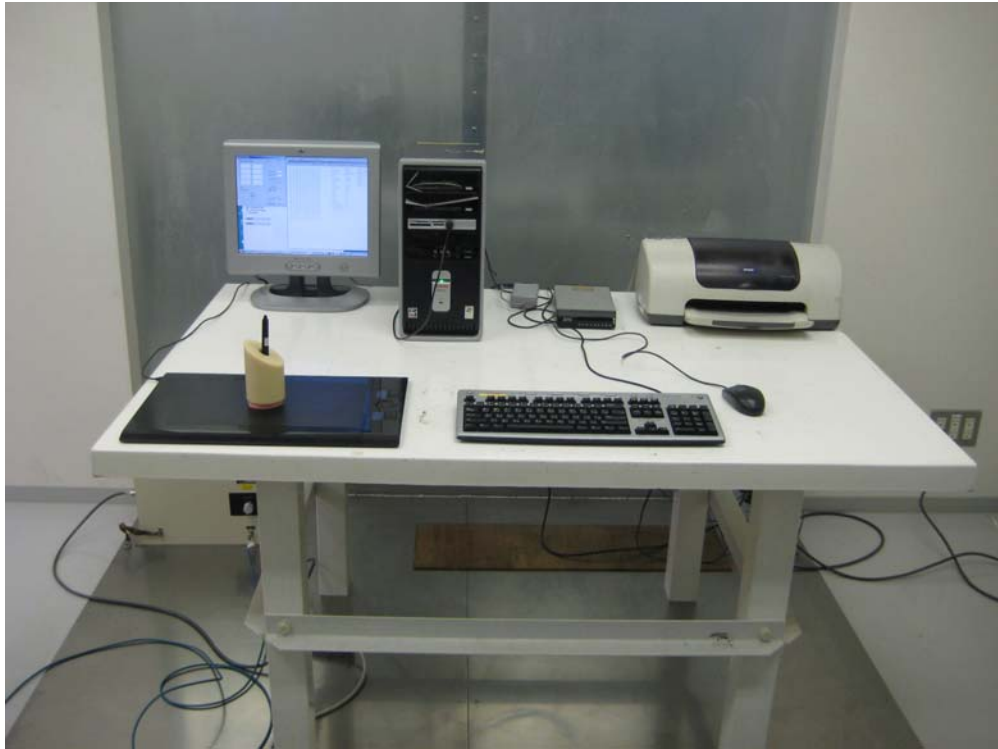
Photo 7.1g Setup with the Maximized Terminal Voltage Emission Level