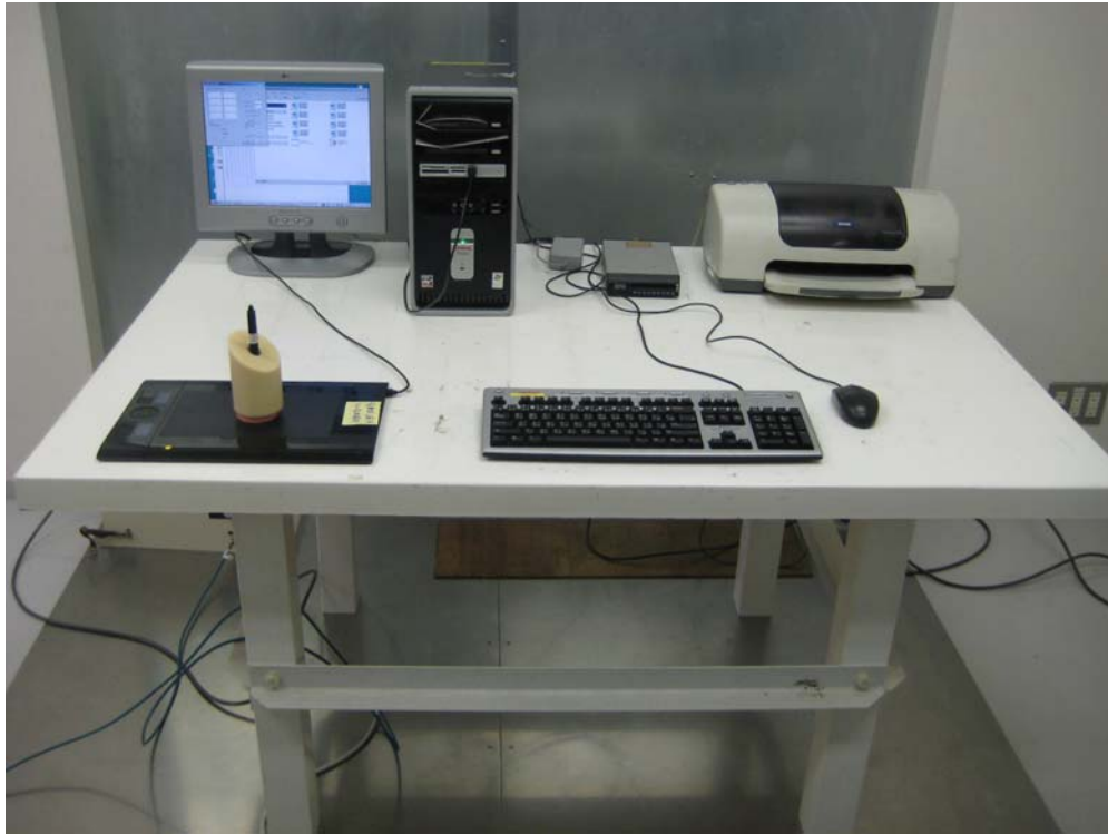
Photo 7.1b Setup with the Maximized Terminal Voltage Emission Level