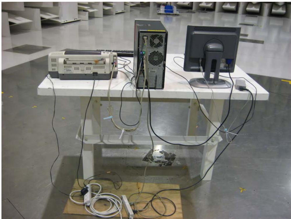
PTK-640 / KP-501E / STJ-276 (Right-handed)