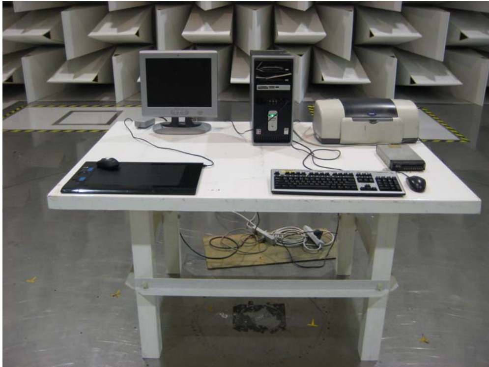
PTK-840 / KC-100 / STJ-276 (Right-handed)