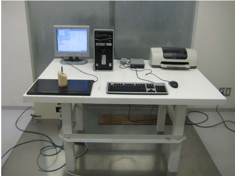
PTK-840 / KP-300E / STJ-276 (Right-handed)