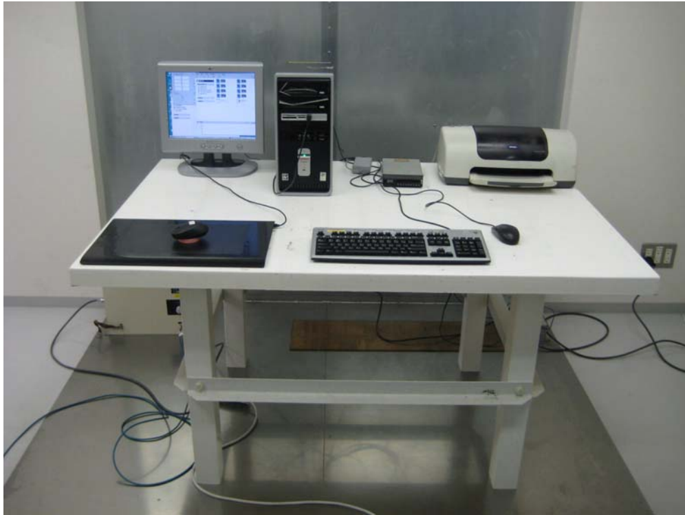
PTK-840 / KC-100 / STJ-276 (Right-handed)