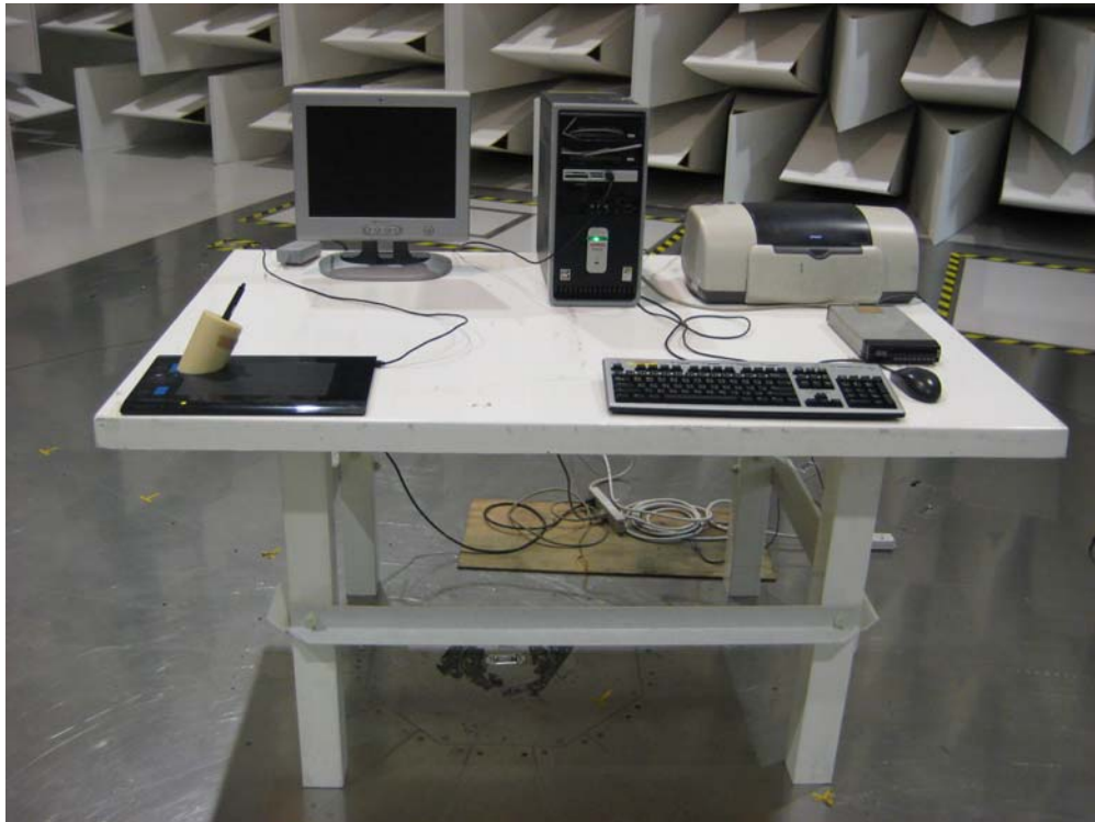
Photo 7.2e Setup with the Maximized RFI Field Strength Emission Level