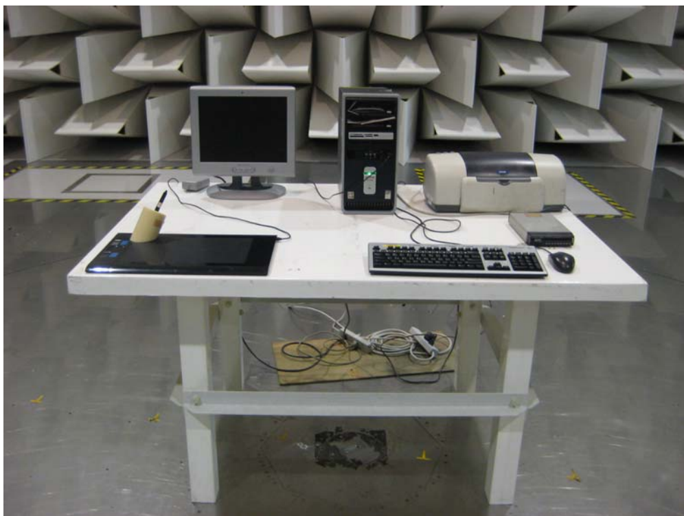
PTK-840 / KP-701E / STJ-276 (Right-handed)