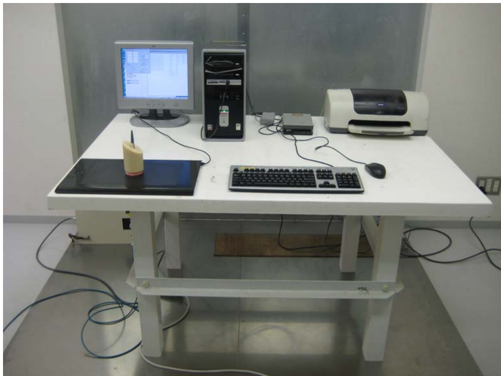
PTK-840 / KP-130 / STJ-276 (Right-handed)