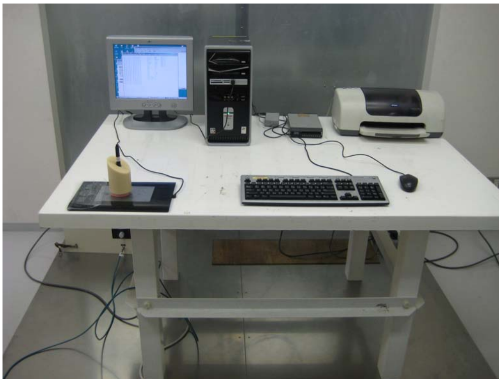
PTK-440 / KP-501E / STJ-277-01 (Right-handed)