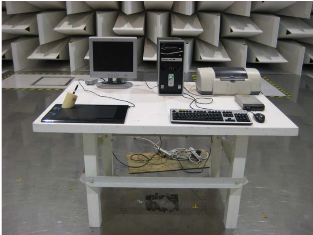
Photo 7.2f Setup with the Maximized RFI Field Strength Emission Level