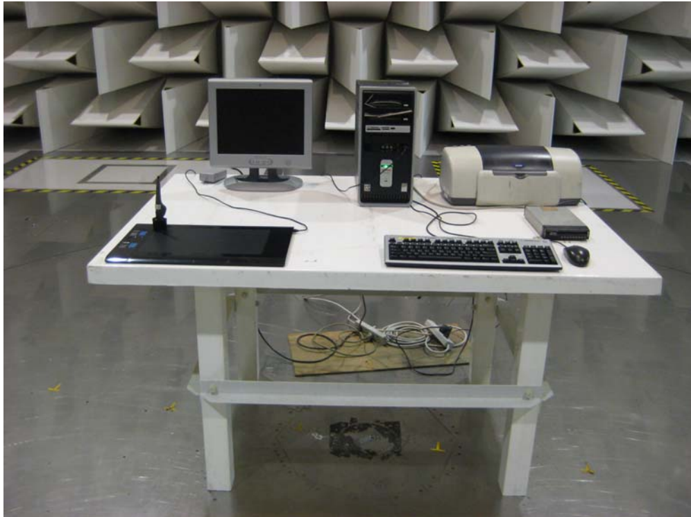
PTK-840 / KP-400E / STJ-276 (Right-handed)