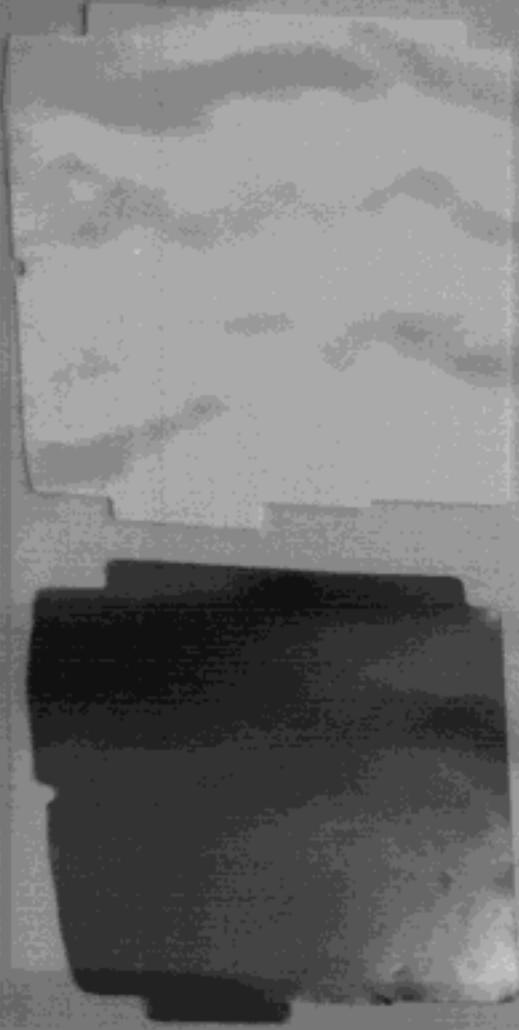
General - Shows internal view of model. Shield sheet - aluminum sheet Separator - 1mm thick. Shield sheet - 0.1 mm thick of Fe-42%Ni Alloy sheet. Copper tape - 40 x 25mm (LxD) Cable - 2.5m (8.2ft). Secondary circuit. With FERRITE CORE.