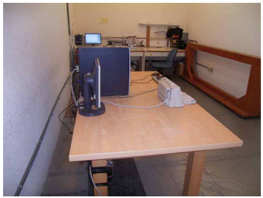
BACK VIEW OF CONDUCTED MEASUREMENT