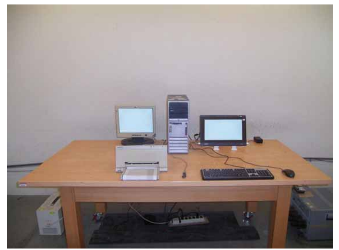
FRONT VIEW OF CONDUCTED MEASUREMENT