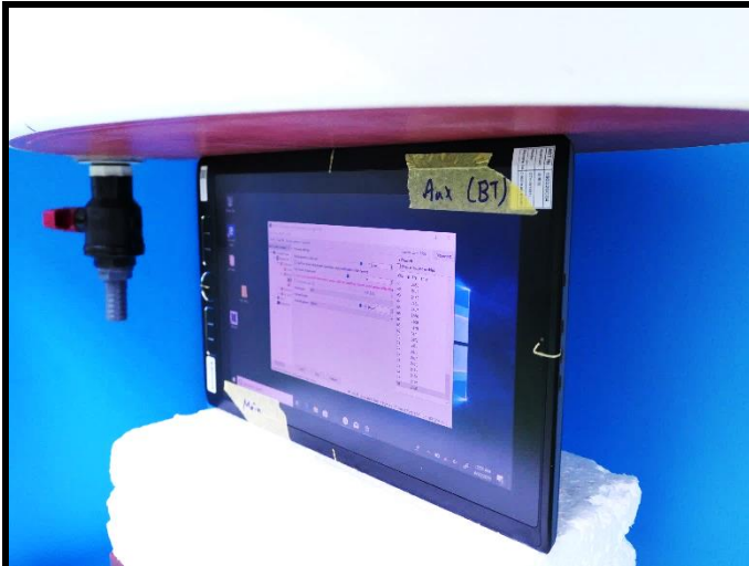
Body - Top Side of EUT at 0 mm