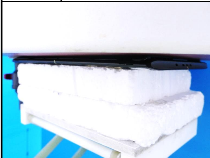
Body - Rear Face of EUT at 0 mm