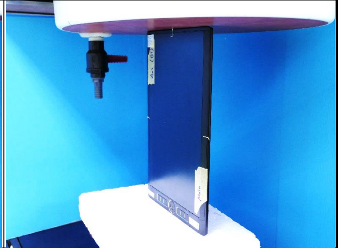
Body - Right Side of EUT at 0 mm