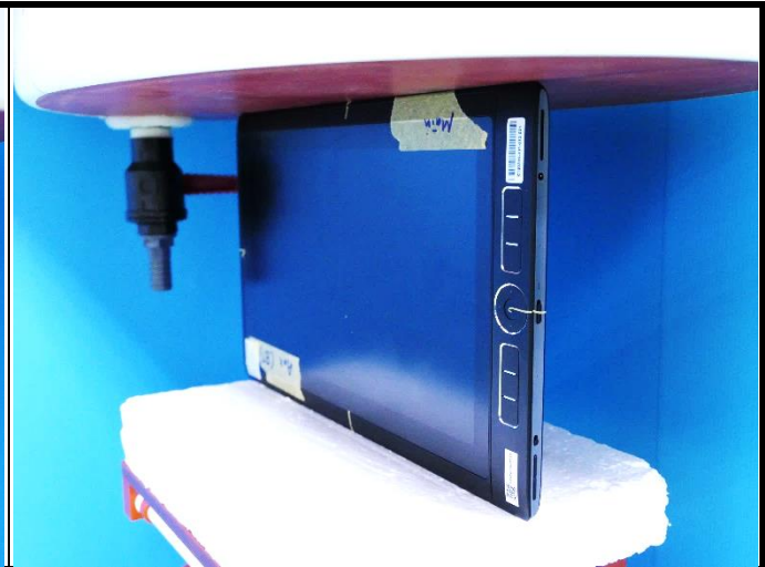
Body - Bottom Side of EUT at 0 mm