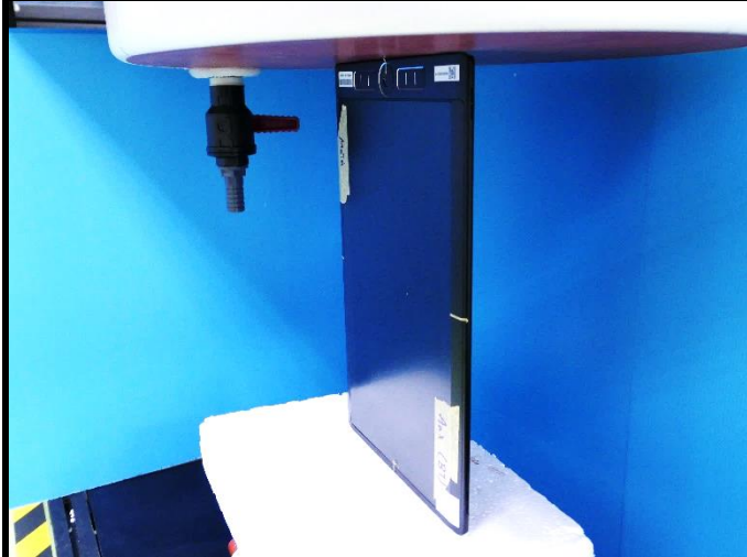
Body - Left Side of EUT at 0 mm