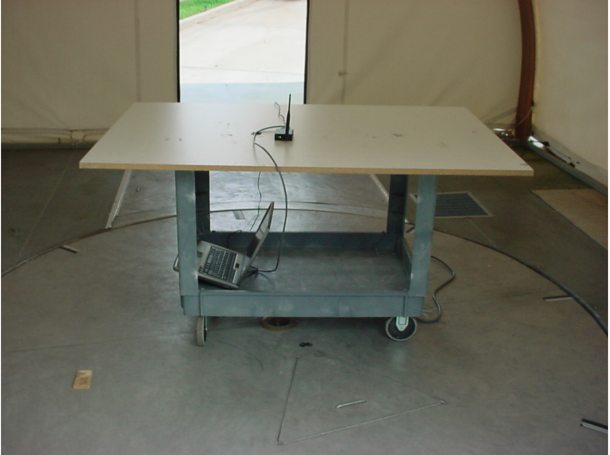
Figure 3: Unintentional Radiated Emissions – Front View