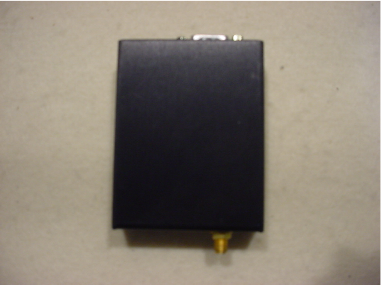
Figure 1: External – Top View