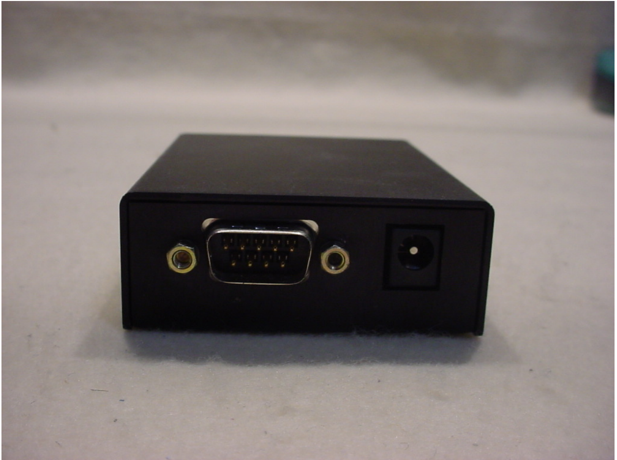
Figure 4: External – Back View