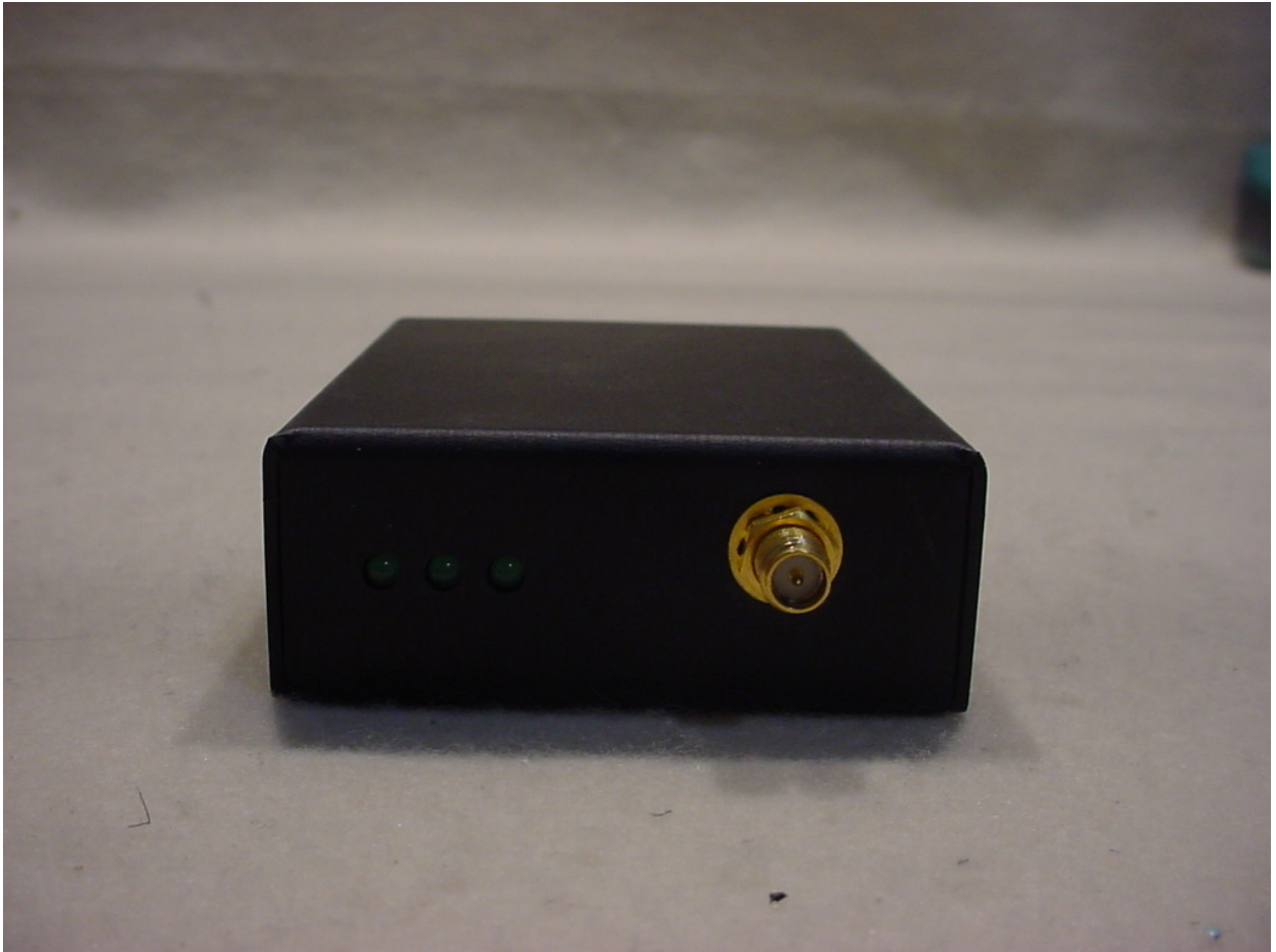
Figure 3: External – Front View