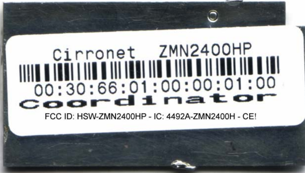
Figure 2: Label Information – Label Placement