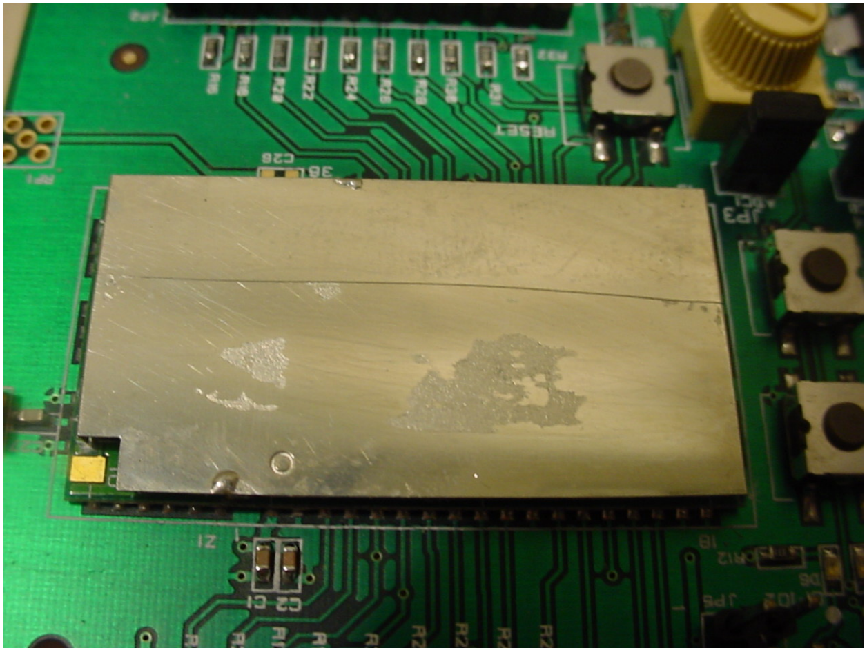
Figure 1: External Photographs – Front View with Shields (On evaluation Board)