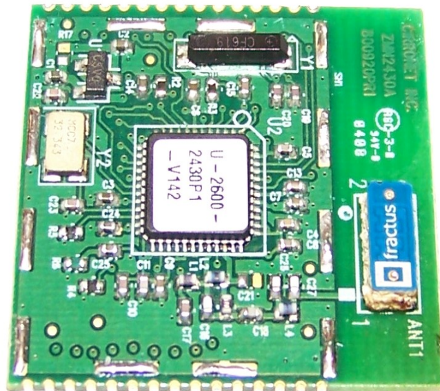
Figure 2: PCB without Shields - Front