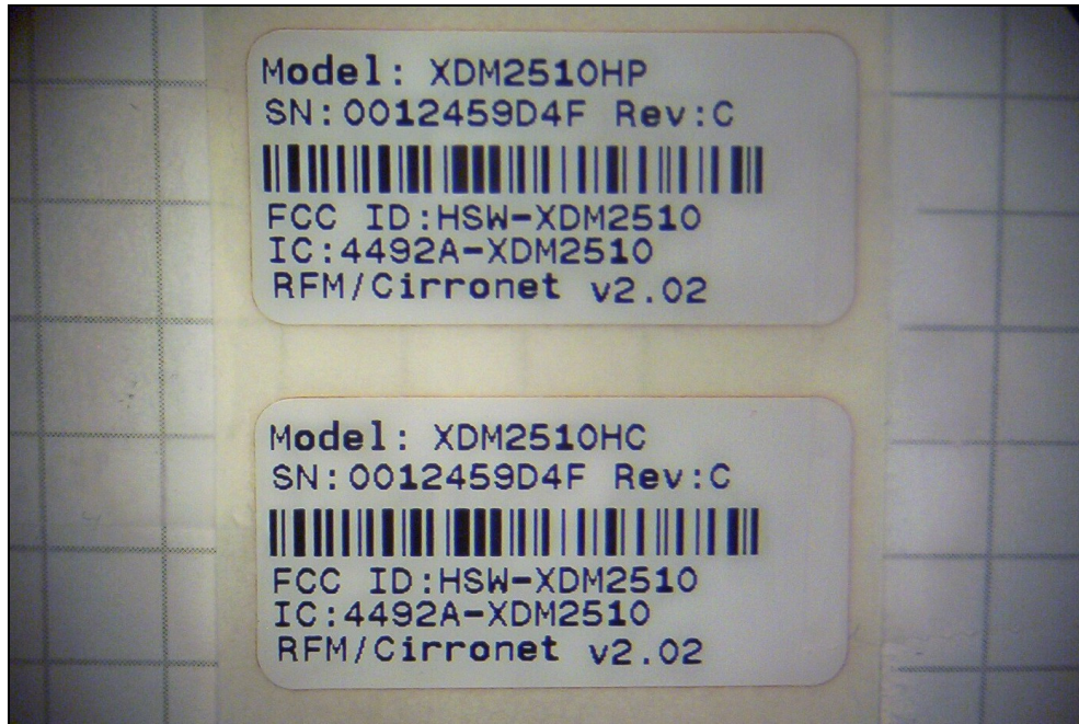
Figure 1: Label Information