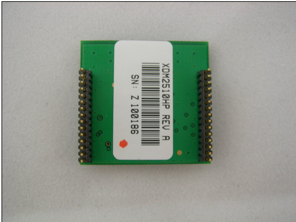
Figure 3: Back