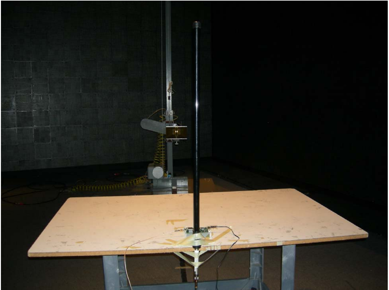
Figure 3: Radiated Emissions – Dipole Antenna