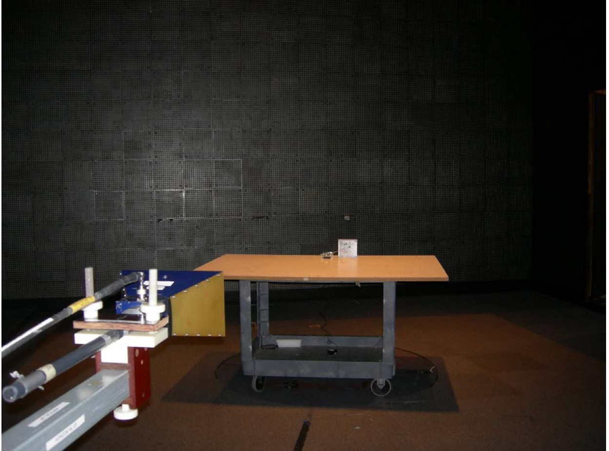
Figure 2: Radiated Emissions – Patch Antenna