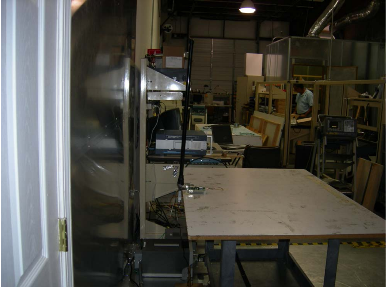
Figure 5: Conducted Emissions – Dipole Antenna