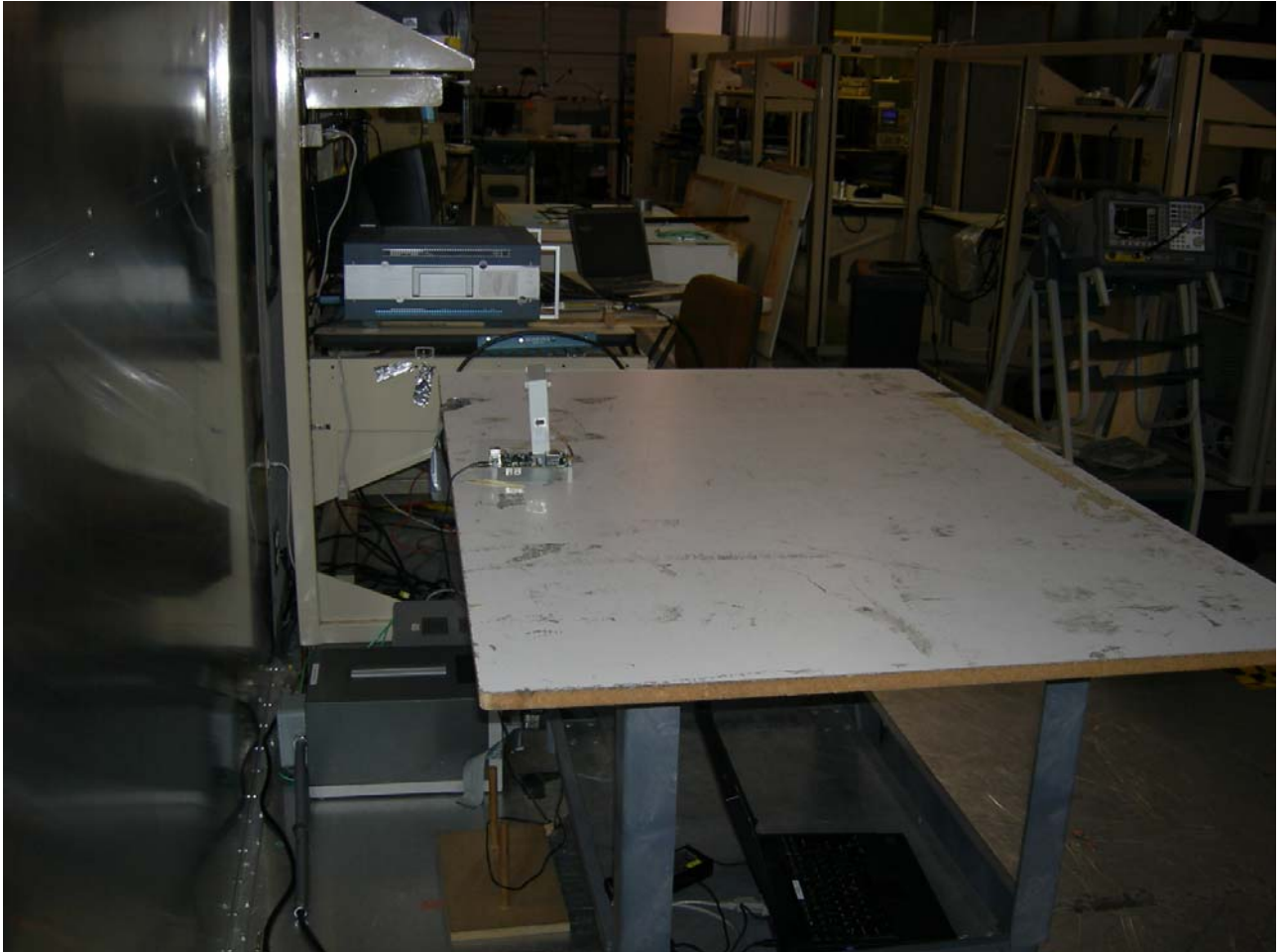
Figure 6: Conducted Emissions – Patch Antenna