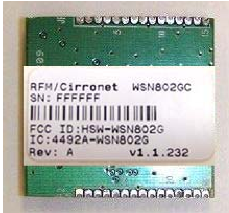
Original WSN802GC Module - Bottom View