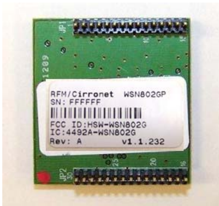
Figure 6: WSN802GP PCB - Back