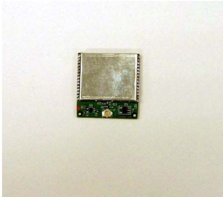
Figure 1: WSN802GC PCB with Shields - Front