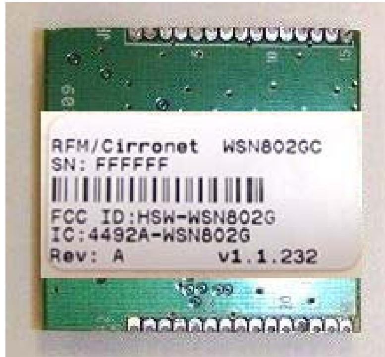
Figure 3: WSN802GC PCB - Back