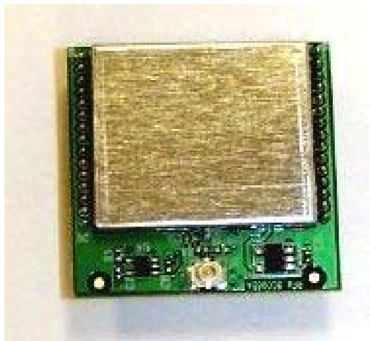
Figure 4: WSN802GP PCB with Shields - Front