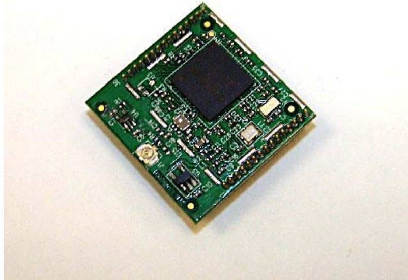
Figure 5: WSN802GP PCB without Shields – Front