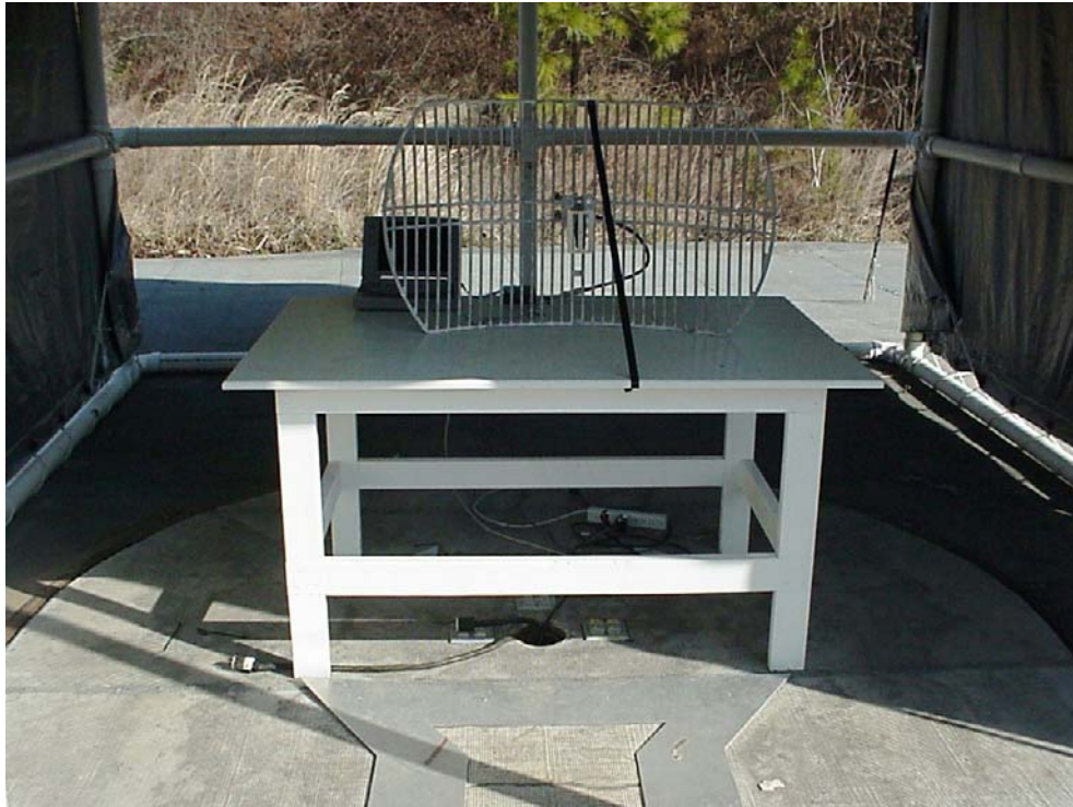
Photograph(s) for Spurious Emissions (24 dBi Parabolic Dish)