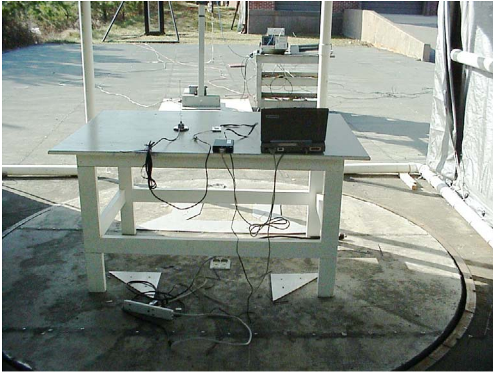
Photograph(s) for Spurious Emissions (5 dBi Whip)