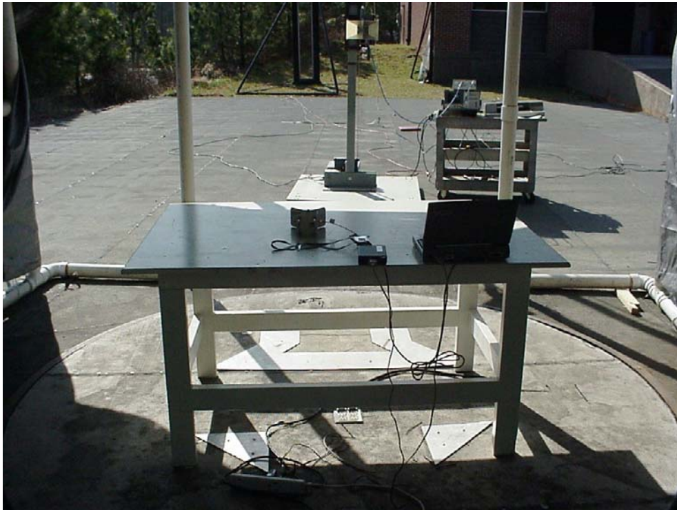
Photograph(s) for Spurious Emissions (9 dBi Corner Reflector)