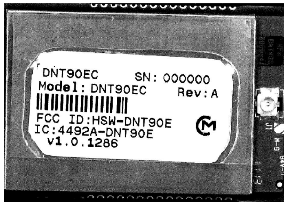
Figure 2: Sample Label and Placement – DNT90EC