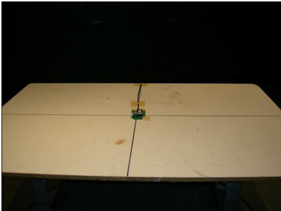
Figure 1: Radiated Emissions – XPOS