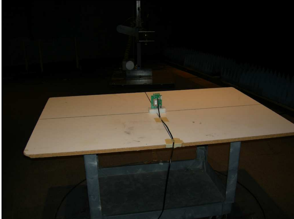
Figure 4: Radiated Emissions – YPOS