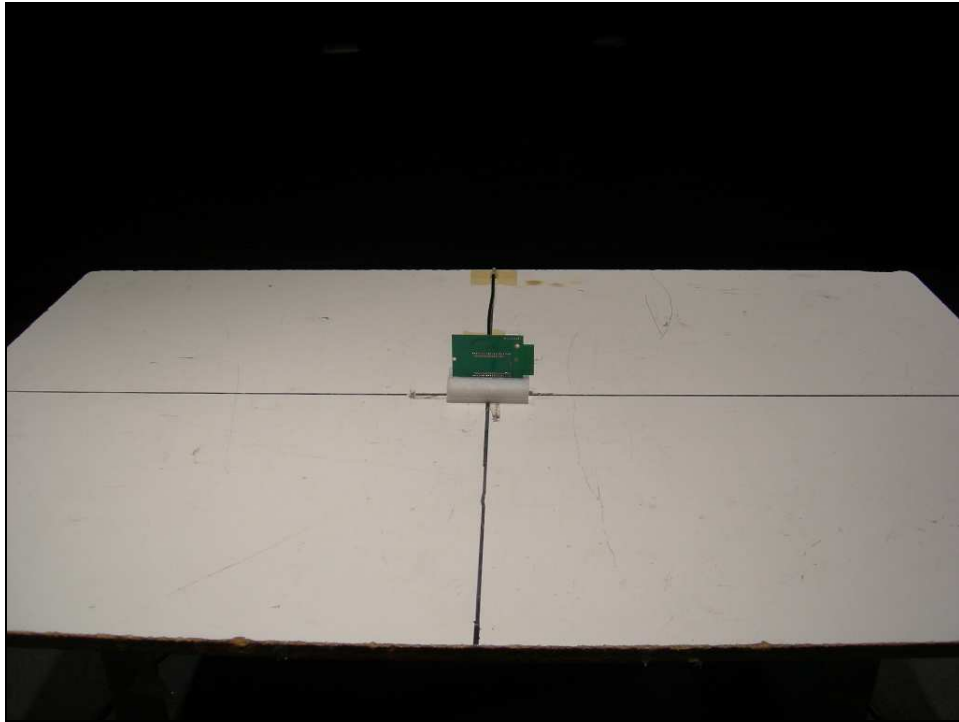
Figure 5: Radiated Emissions – ZPOS