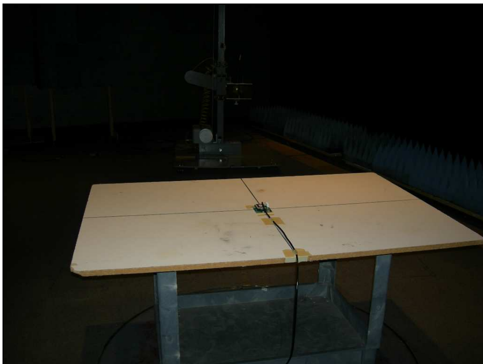
Figure 2: Radiated Emissions – XPOS