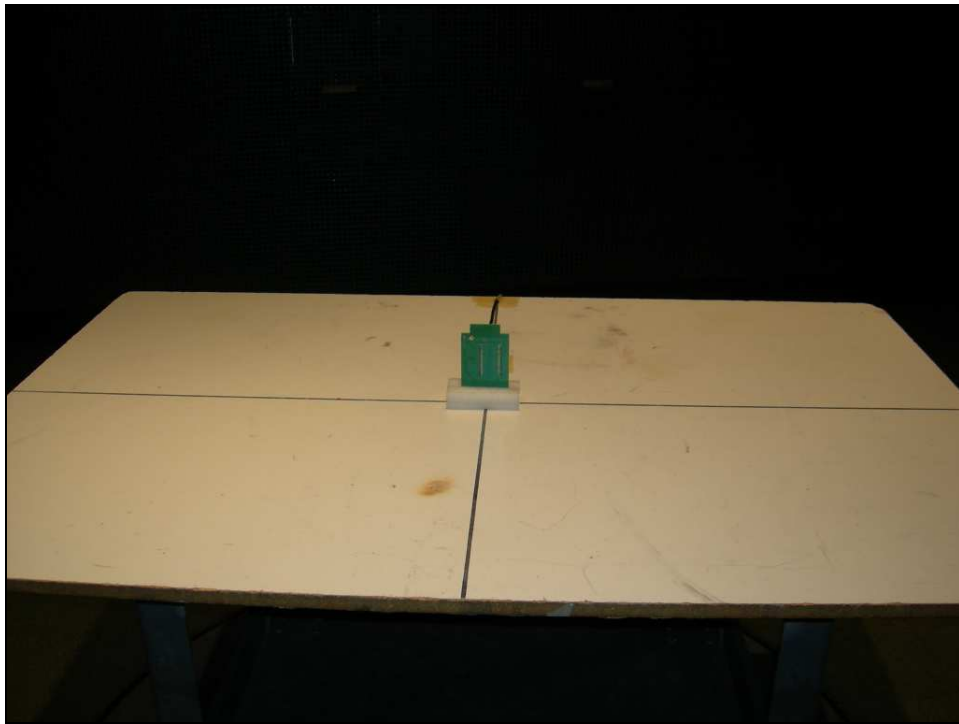
Figure 3: Radiated Emissions – YPOS