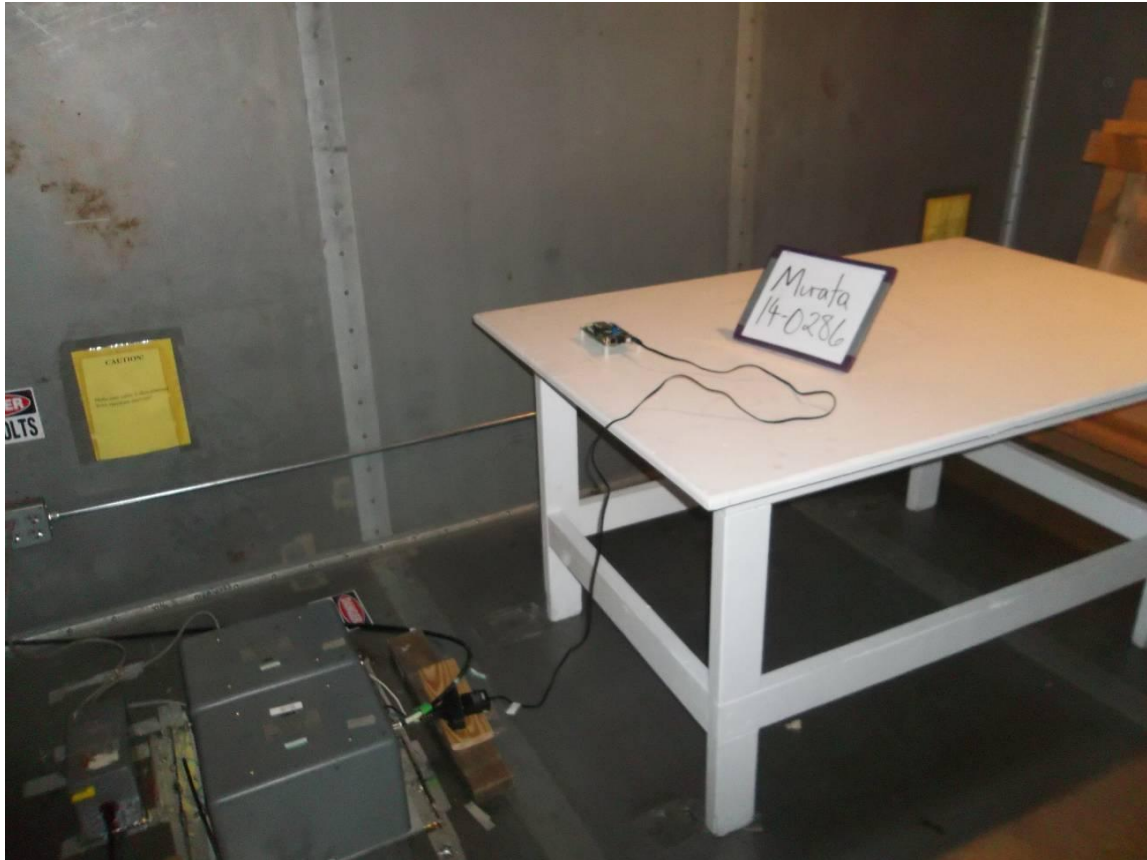
Figure 7. Power Line Conducted Emission Test Setup

14-0286 RFM 12/3/2014 DNT90 HSW-DNT90 4492A-DNT90