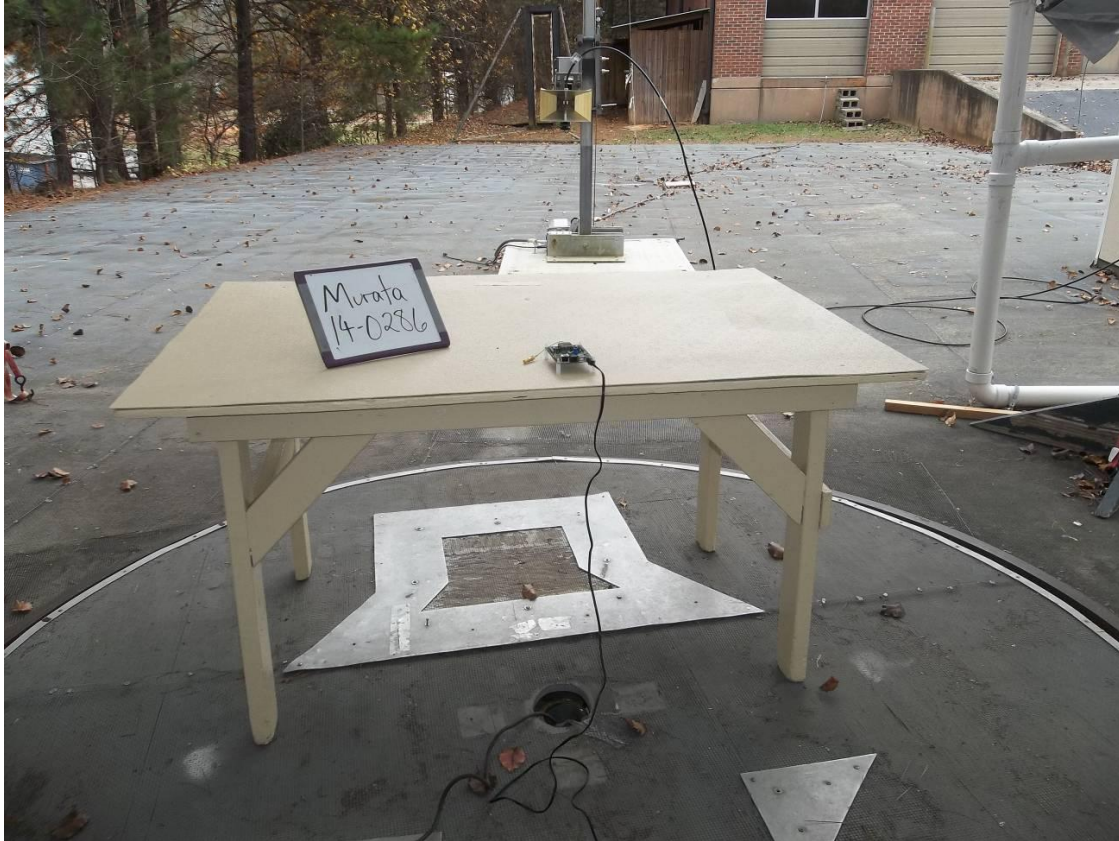
Figure 6. Radiated Emissions Test Setup, Above 1 GHz

14-0286 RFM 12/3/2014 DNT90 HSW-DNT90 4492A-DNT90