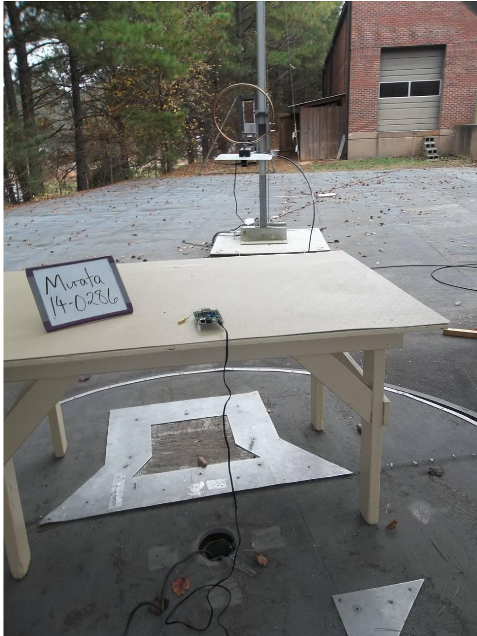
Figure 3. Radiated Emissions Test Setup, 150 kHz o 30 MHz