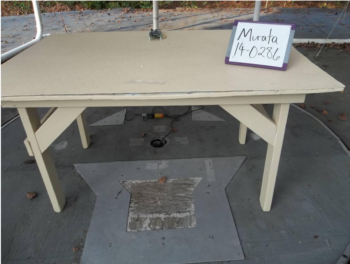
Figure 1. Radiated Emissions Test Setup, Front View