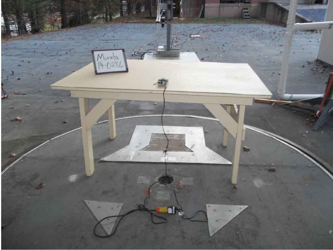
Figure 5. Radiated Emission Test Setup, 200 MHz to 1 GHz