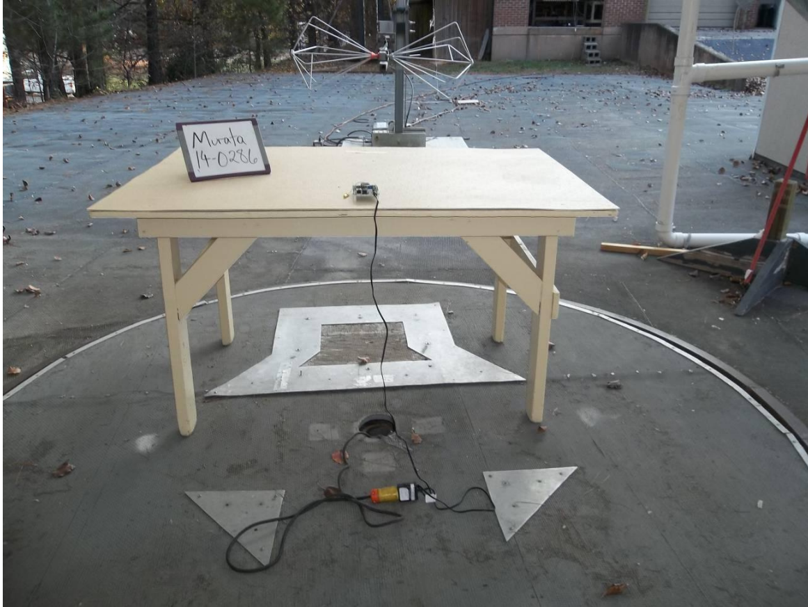
Figure 4. Radiated Emission Test Setup, 30 MHz to 200 MHz