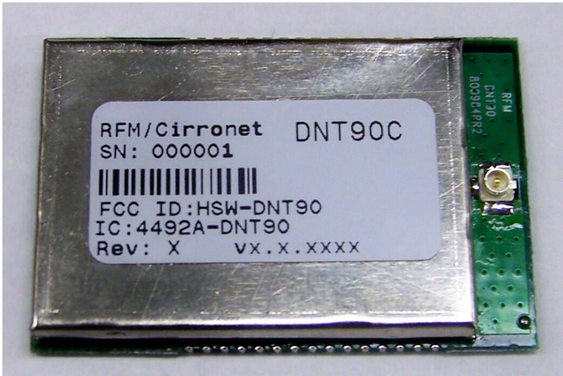
Figure 1: PCB (DNT90C) – Front