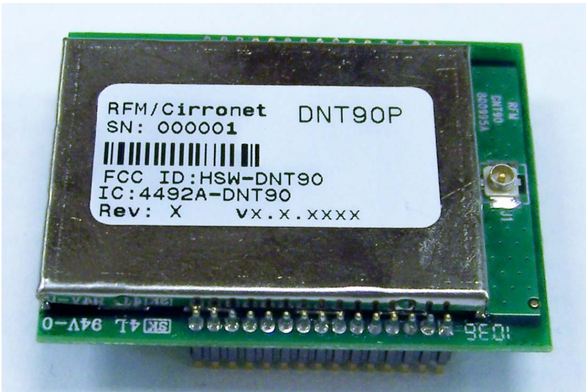
Figure 2: PCB (DNT90P) - Front