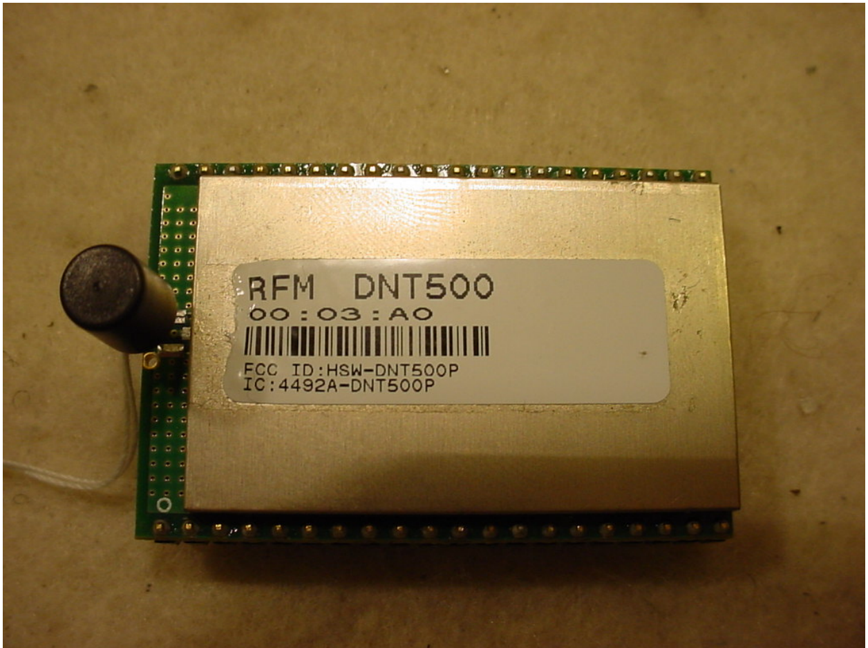
Figure 1: External Photos - Top