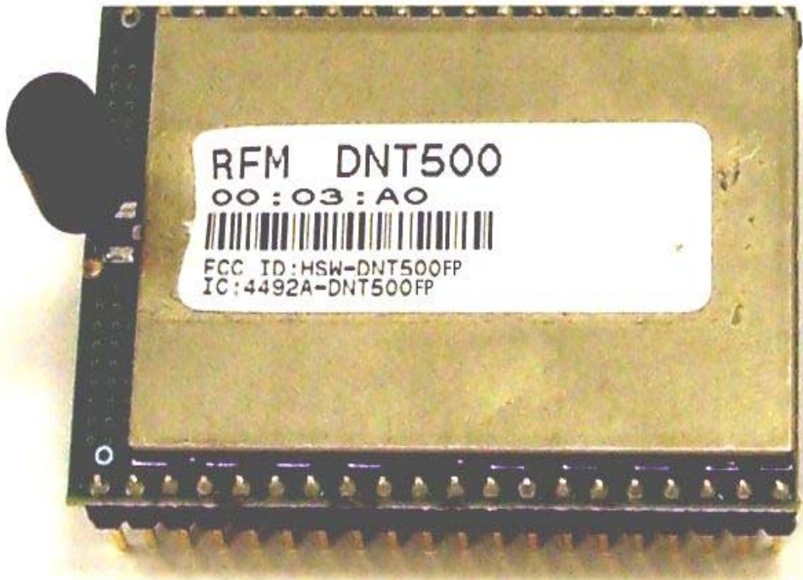
Figure 1: PCB with Shields - Front