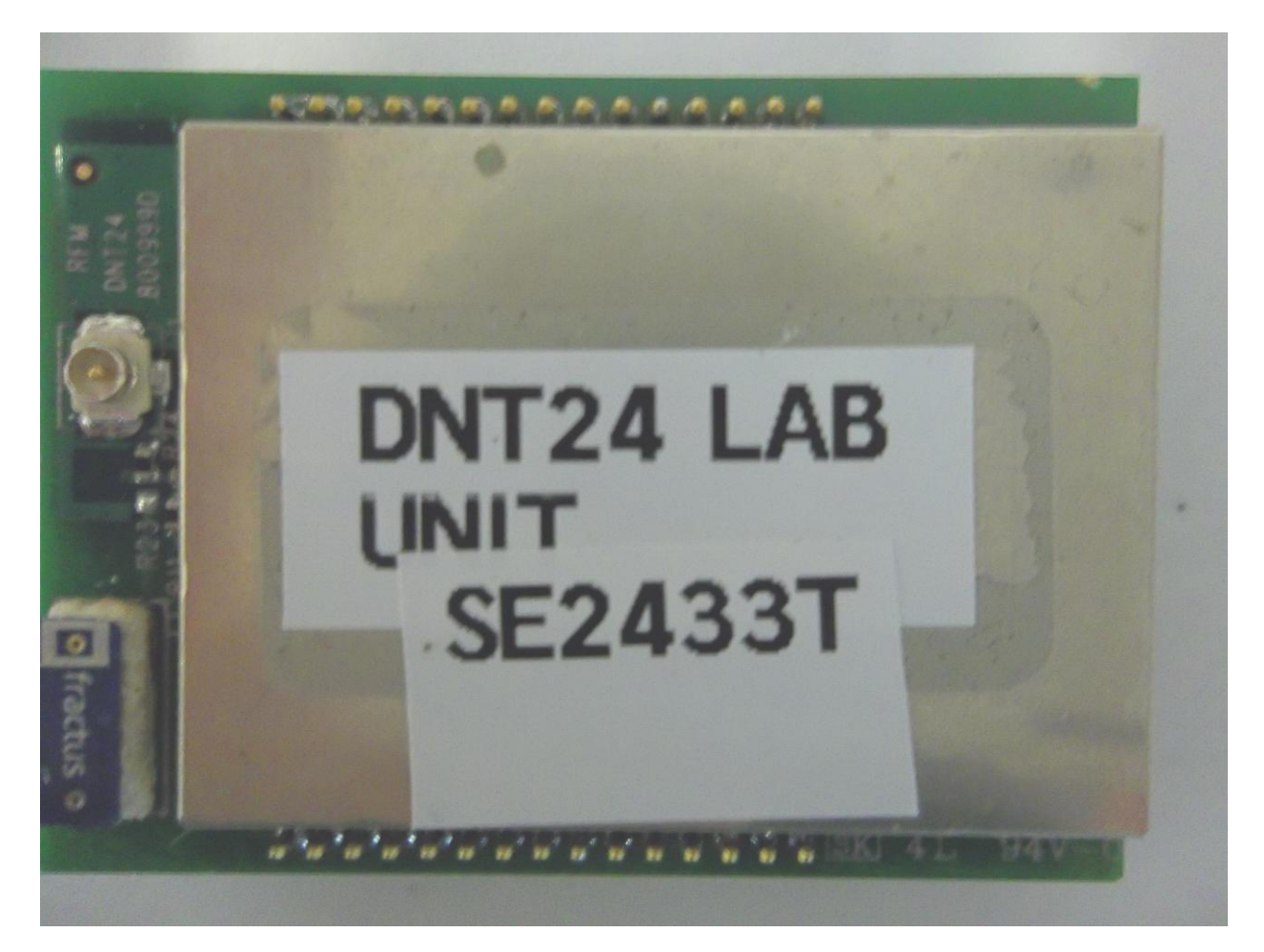
Figure 1. Top of EUT

Note: Castellated is version is identical but castellated.