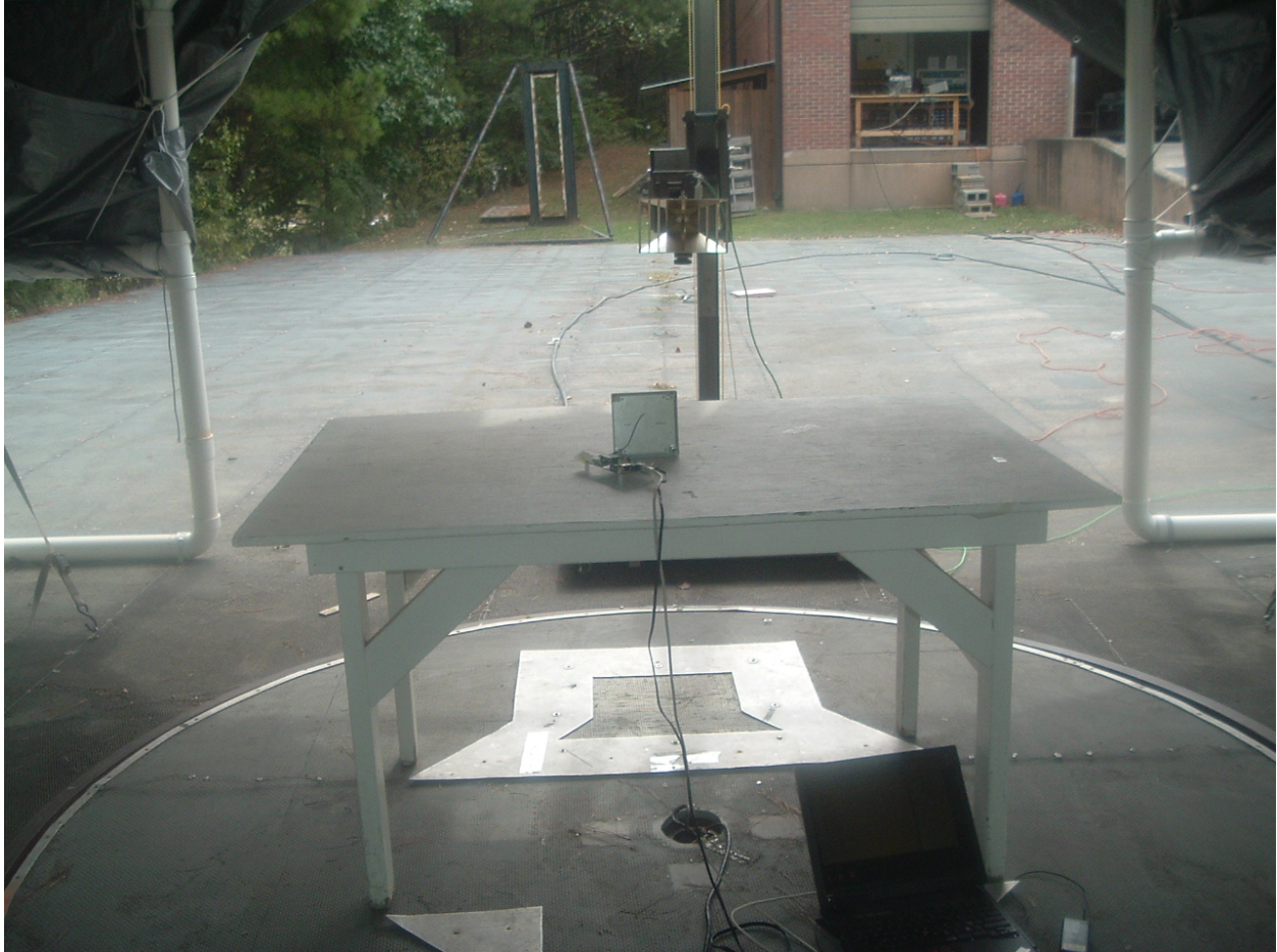
Figure 6. Patch Antenna (Rear View)