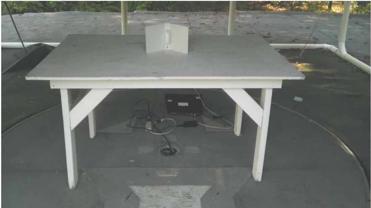
Figure 1. Corner Reflector Antenna