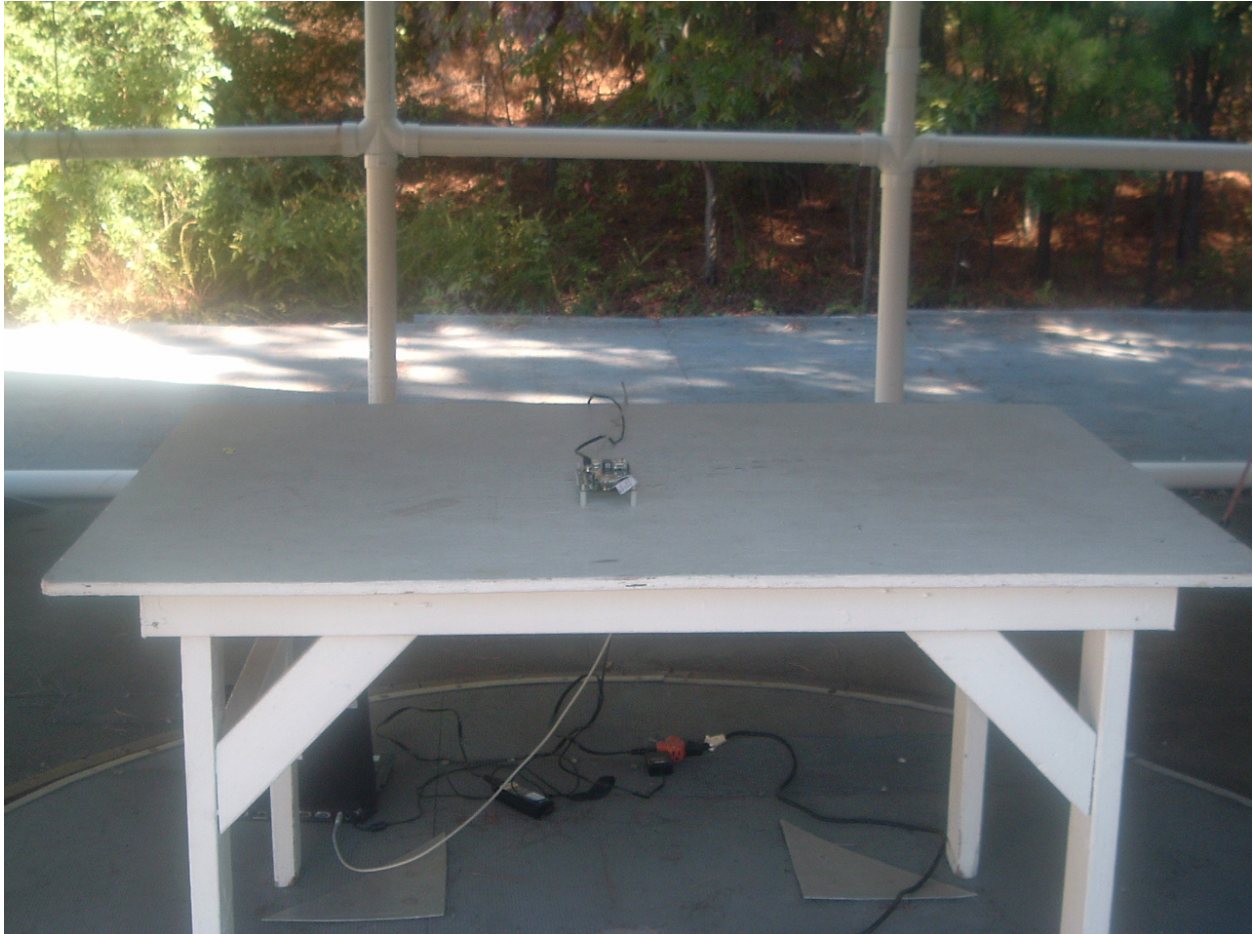
Figure 7. Fractus Chip Antenna