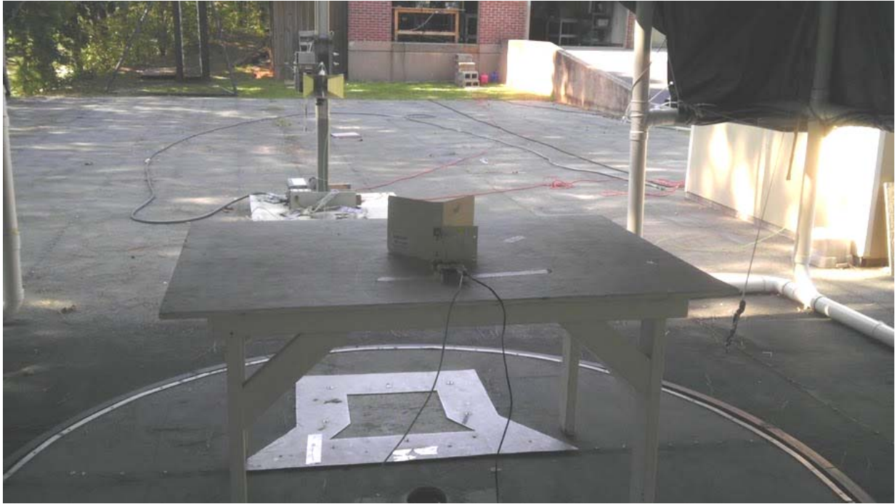
Figure 2. Corner Reflector Antenna (Rear View)