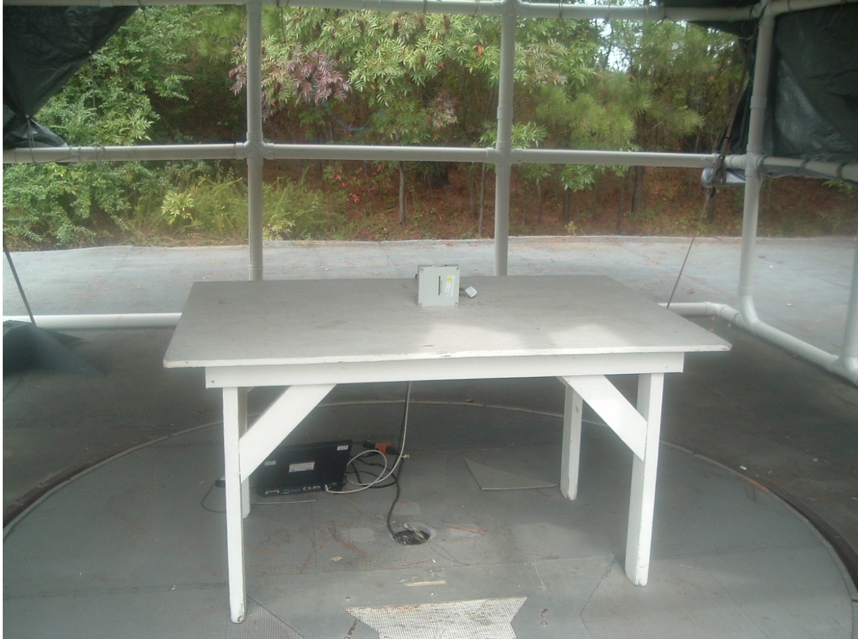
Figure 5. Patch Antenna