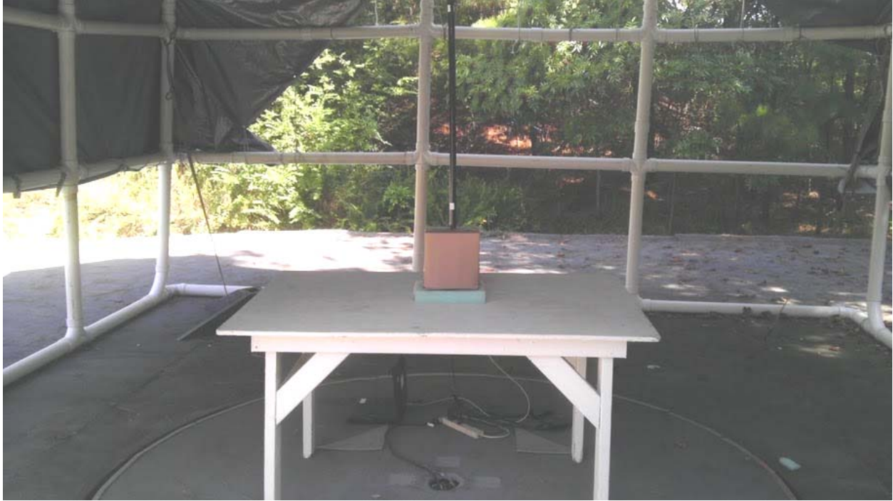
Figure 3. Omni Directional Antenna