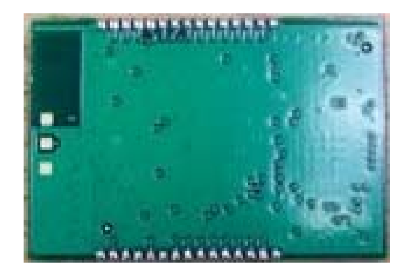
DNT24C and DNT24CA Bottom View

US Tech Client Issue Date Model: FCC ID: IC ID: