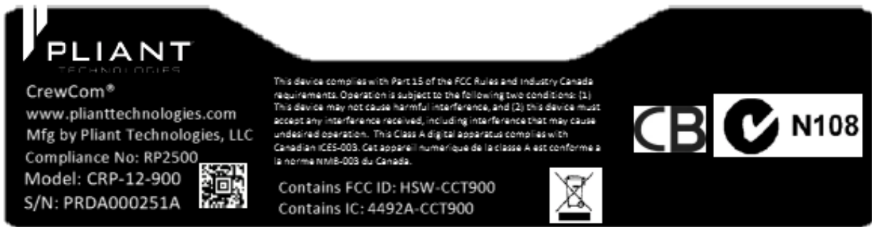
Figure 4: Sample Label – CRP-12-900