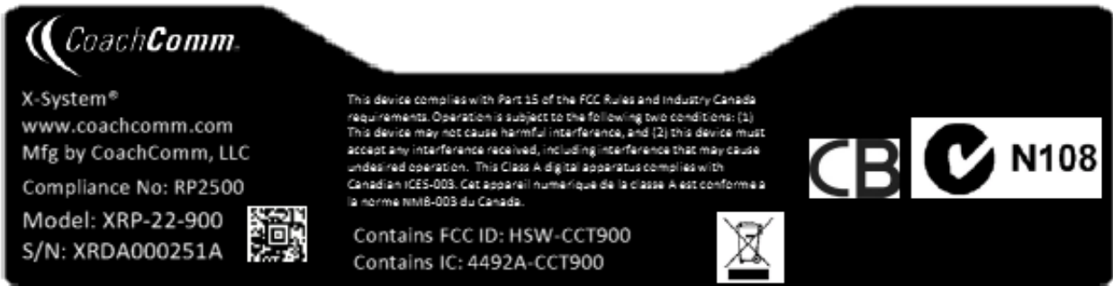
Figure 6: Sample Label – XRP-22-900