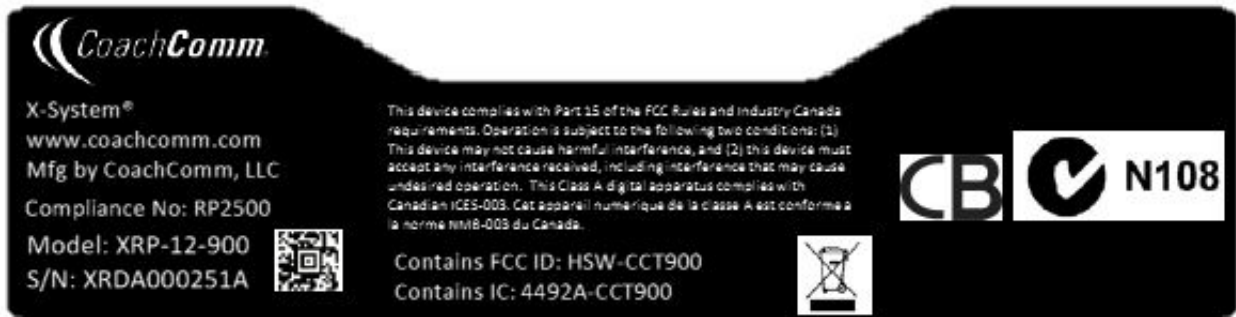
Figure 5: Sample Label – XRP-12-900