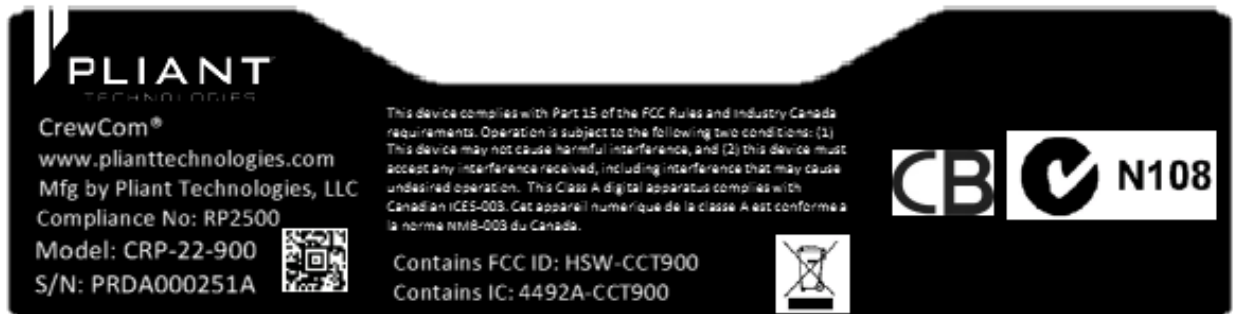
Figure 2: Sample Label – CRP-22-900