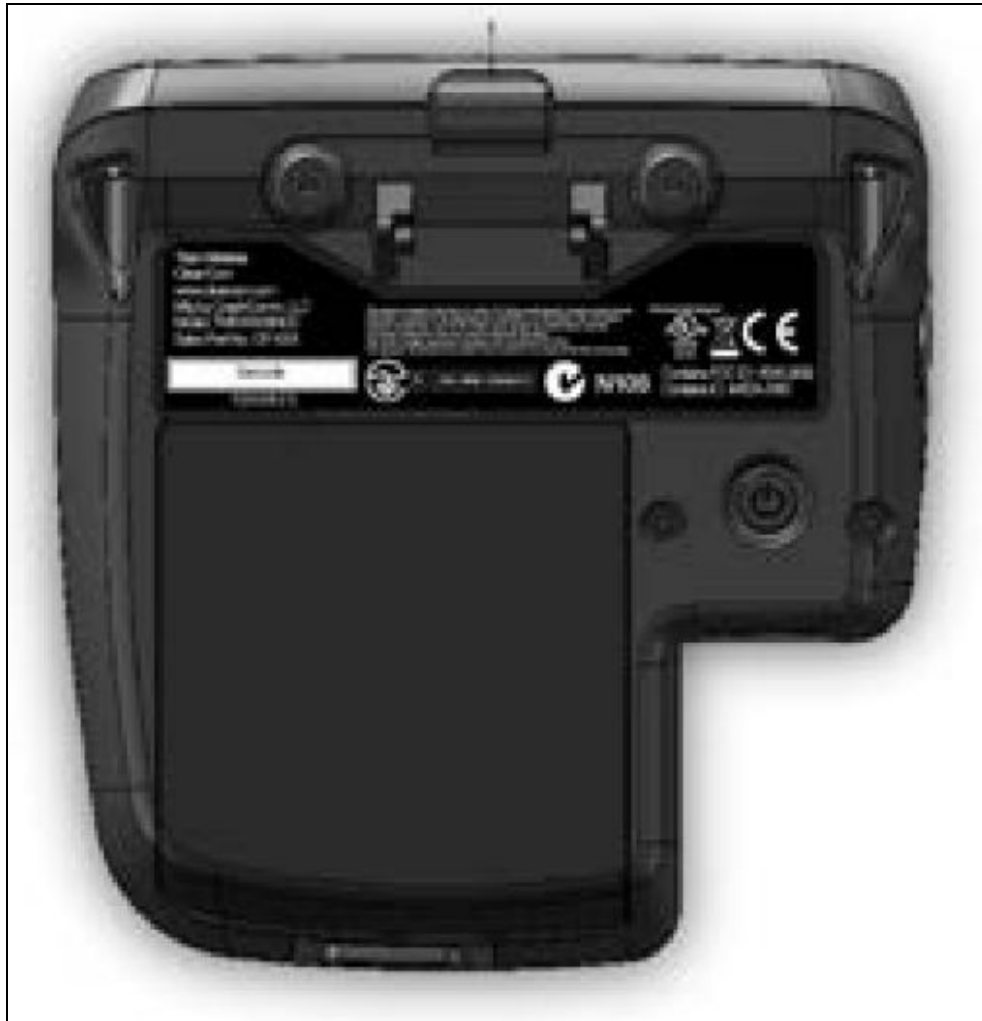
Figure 1: Sample Label Location