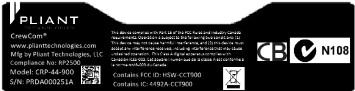
Figure 3: Sample Label – CRP-44-900