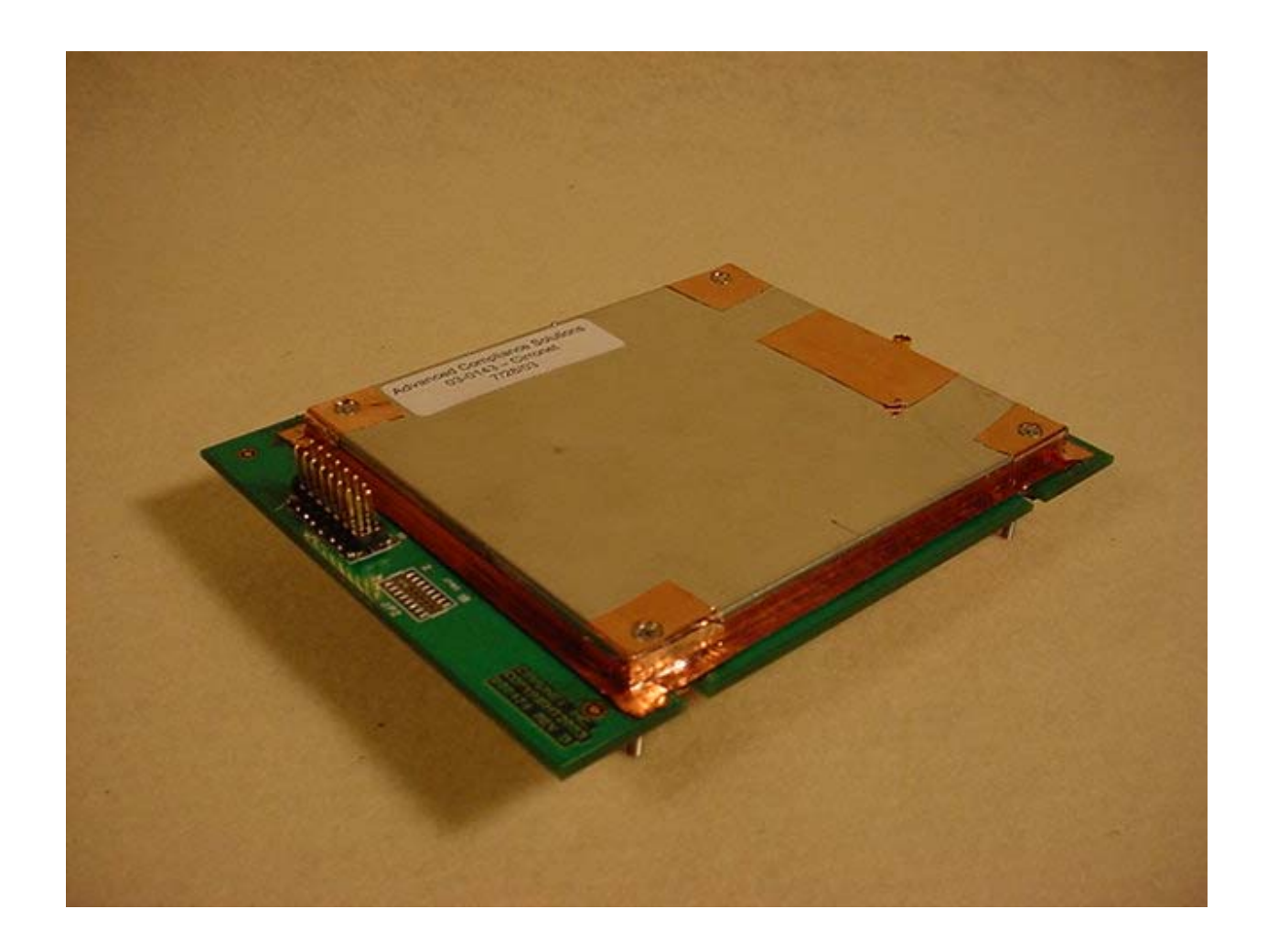
Figure 1: Top-Front View