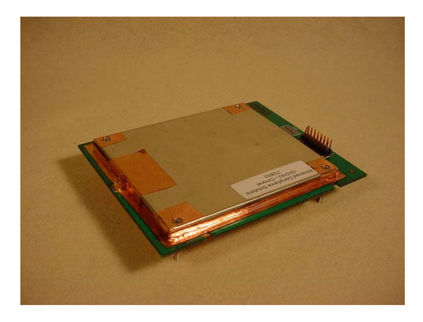
Figure 2: Top-Rear View