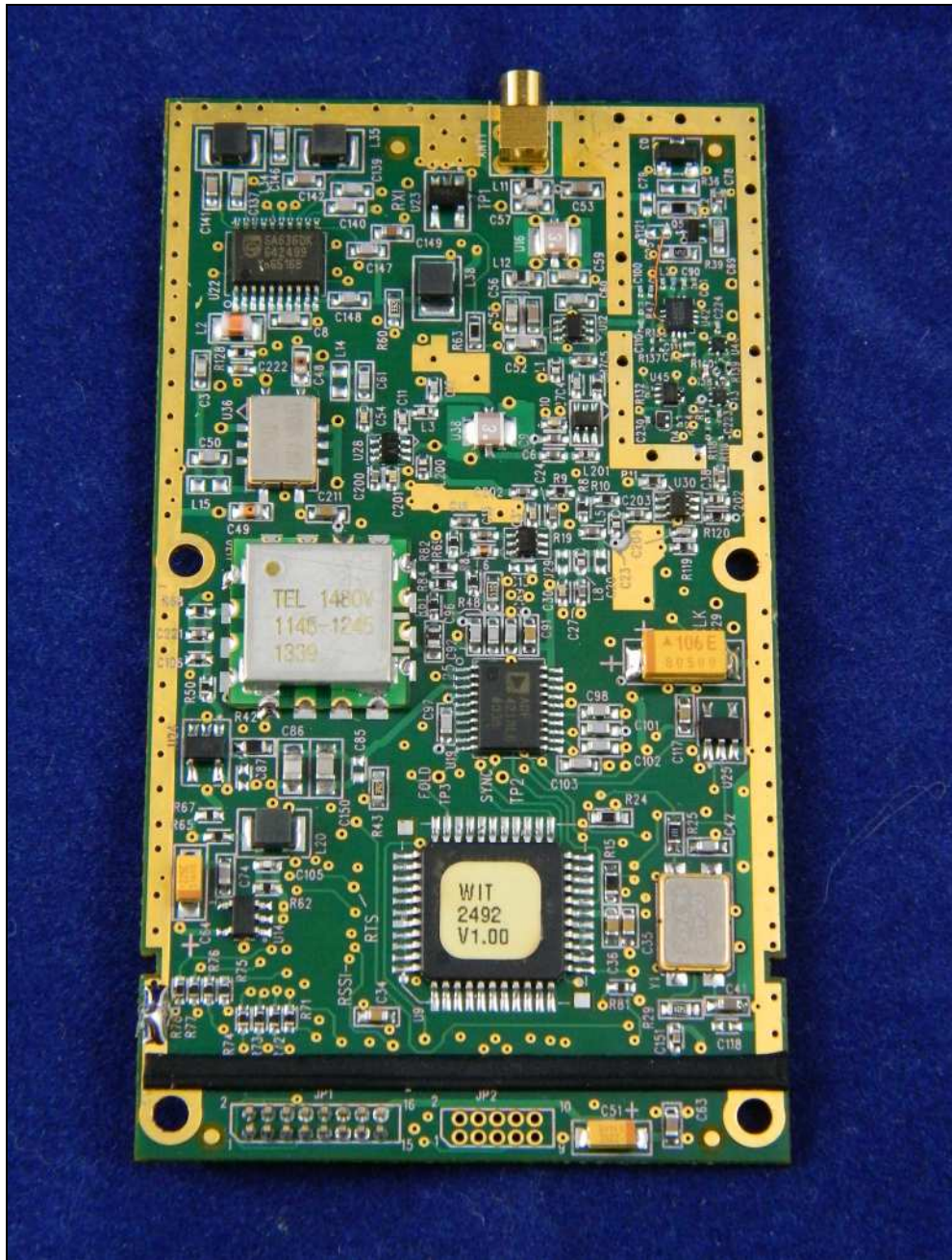
Figure 2: Internal Photo