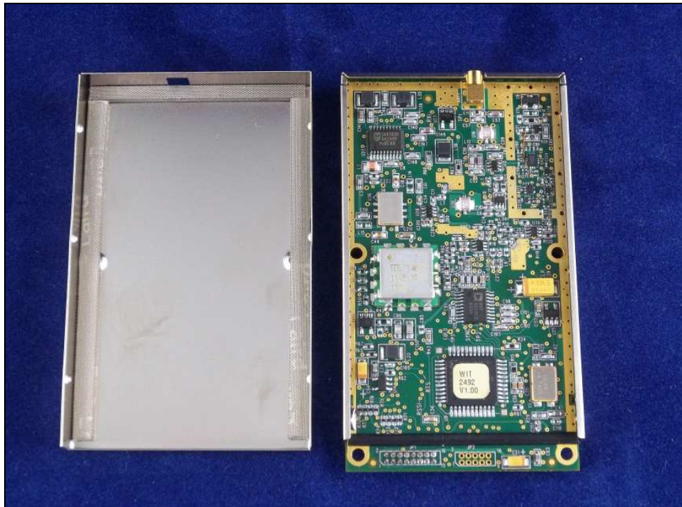
Figure 1: Internal Photo