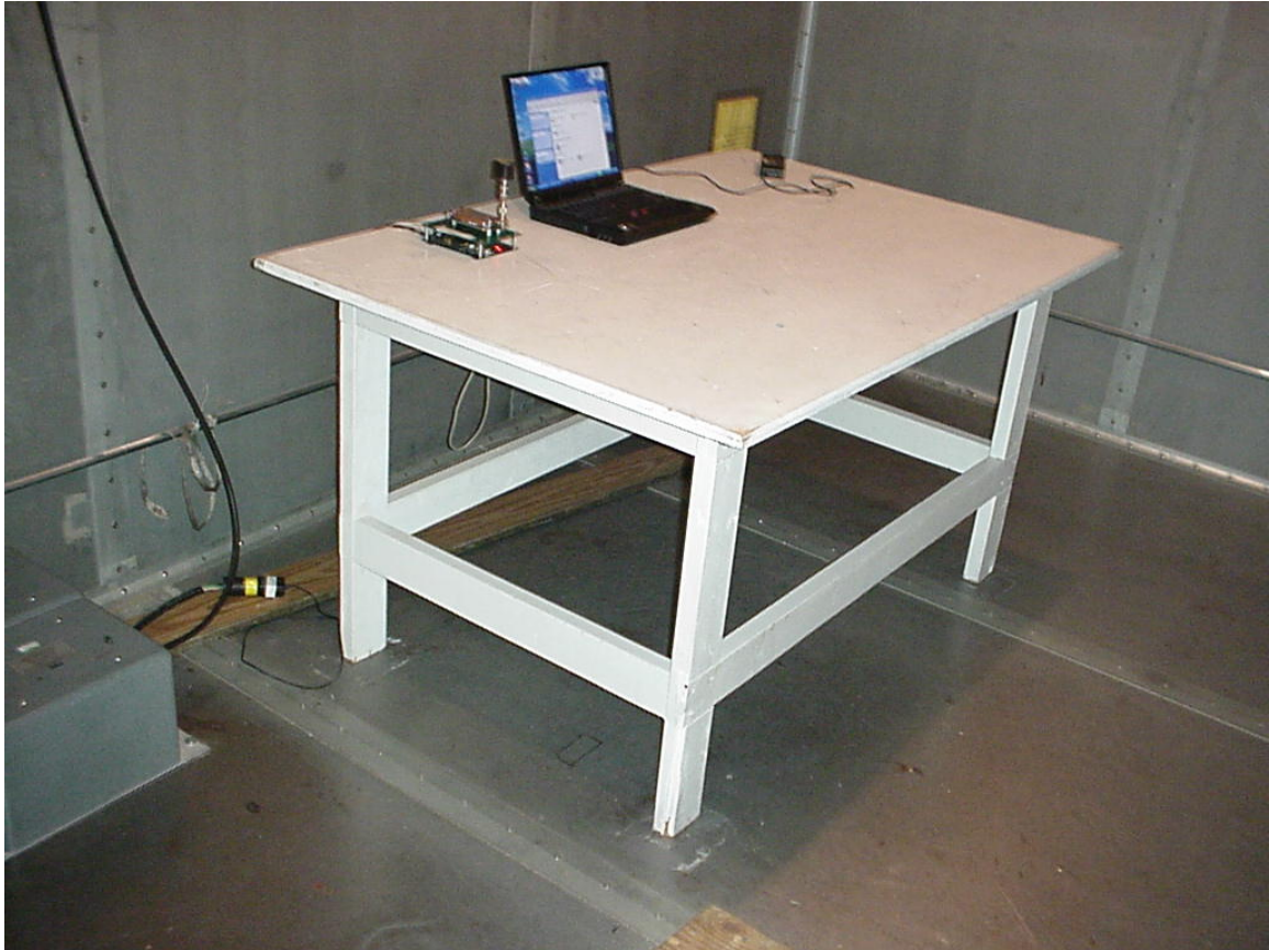
FIGURE 2C Photograph(s) for Conducted Emissions

UST Project: 07-0087 Customer: Cirronet Model: WIT2410T