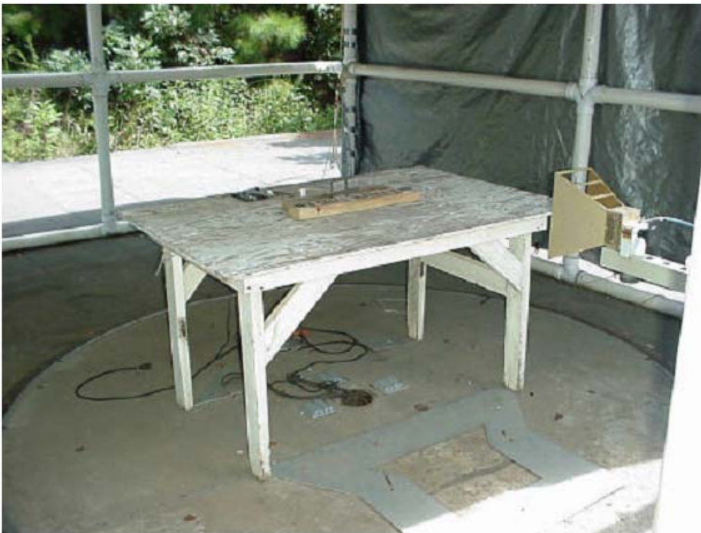
Cirronet 12 dBi Patch Antenna