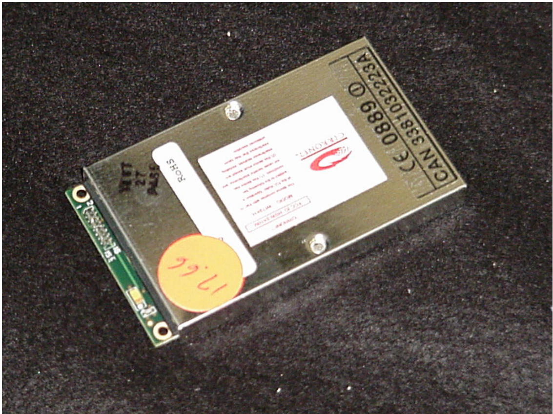
Figure 1: PCB with Shields - Front