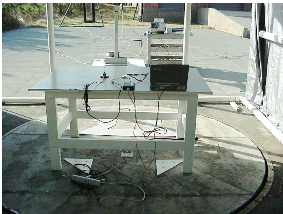
Photograph(s) for Spurious Emissions (5 dBi Whip)