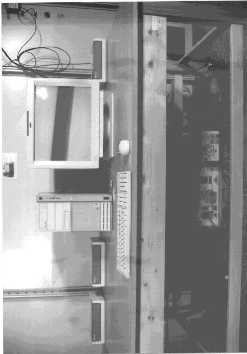
5.1 Test setup, conducted emission, front side view