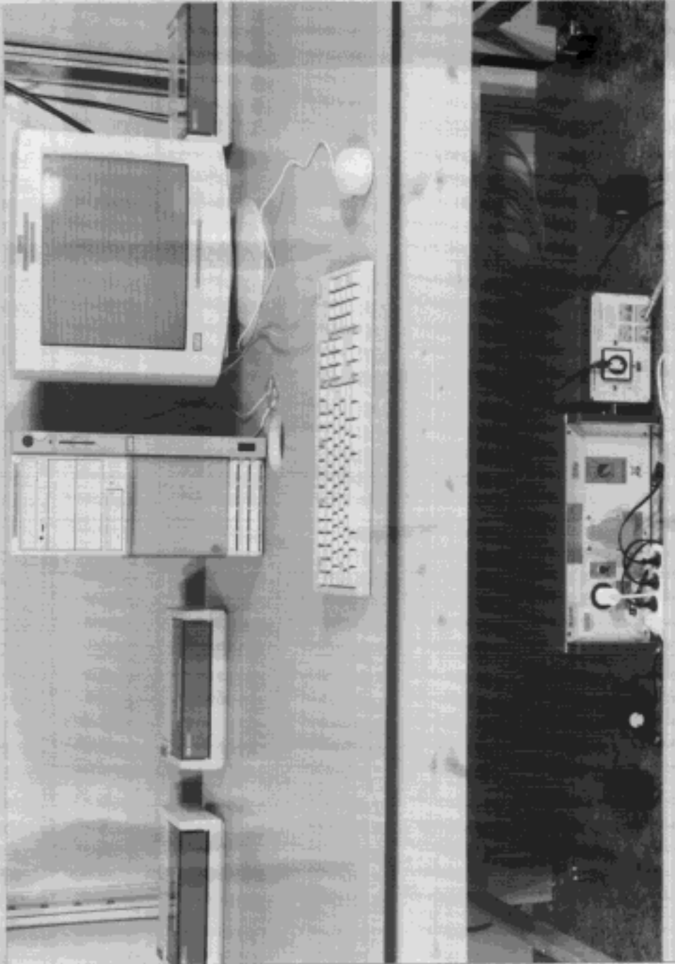
5.1 Test setup, conducted emission, front side view