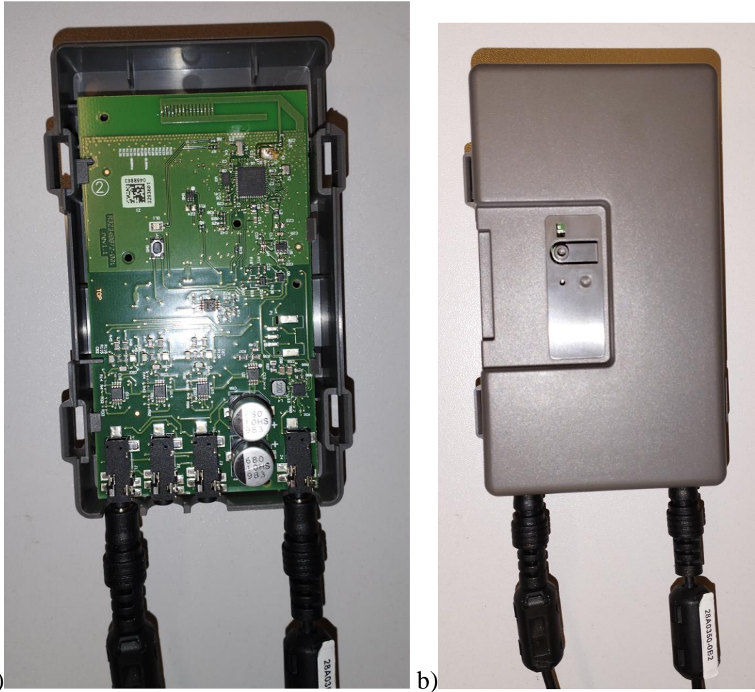
Figure 4. PCB assembled, a) back-plate plastic, b) complete plastic housing