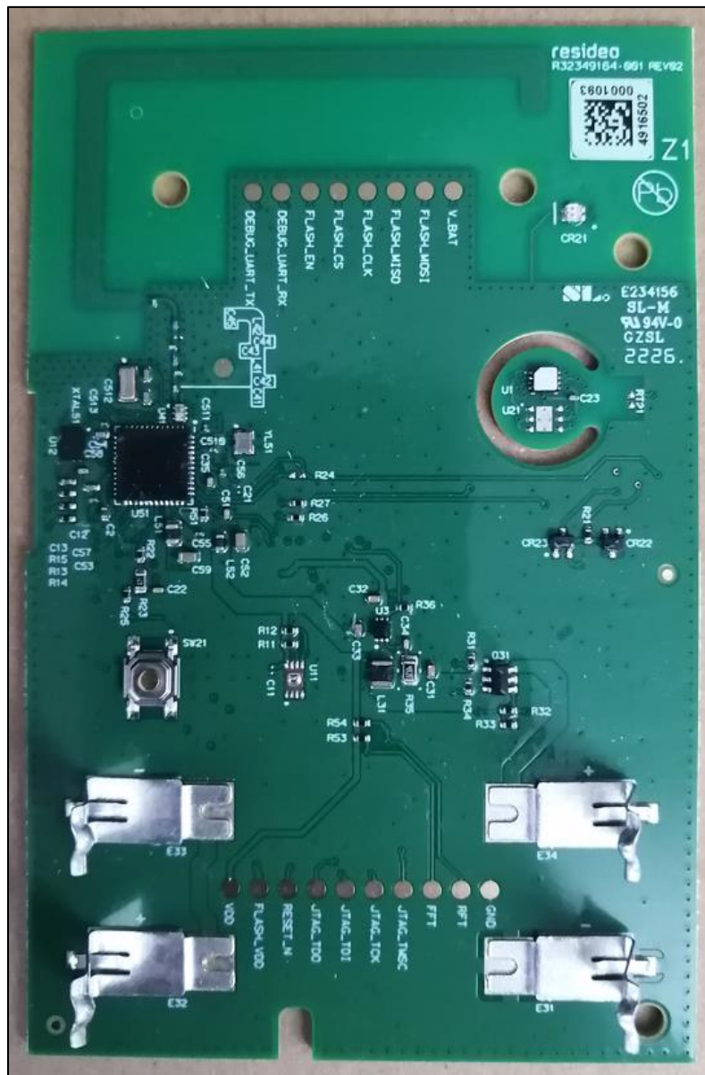
Figure 1. PCB Top side view.