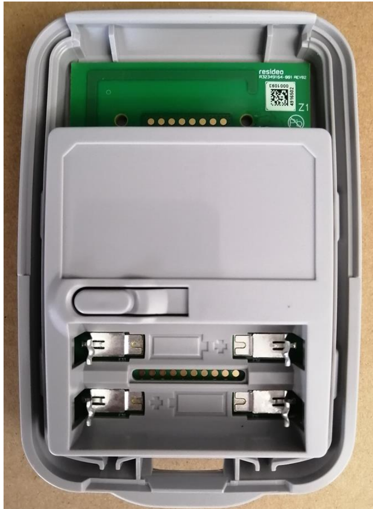
Figure 4. PCB assembled.