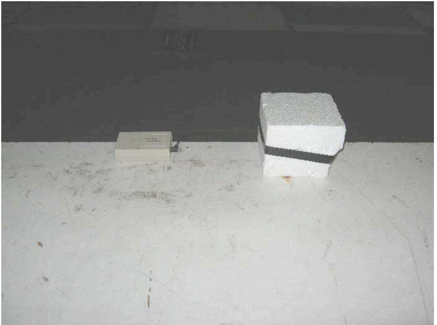
Test set up front