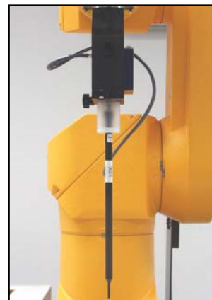
Isotropic E-Field Probe