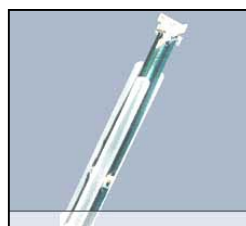
Interior of probe