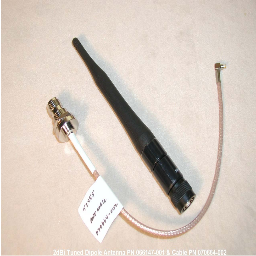
2dBi Tuned Dipole Antenna PN 066147-001 & Cable PN 070664-002