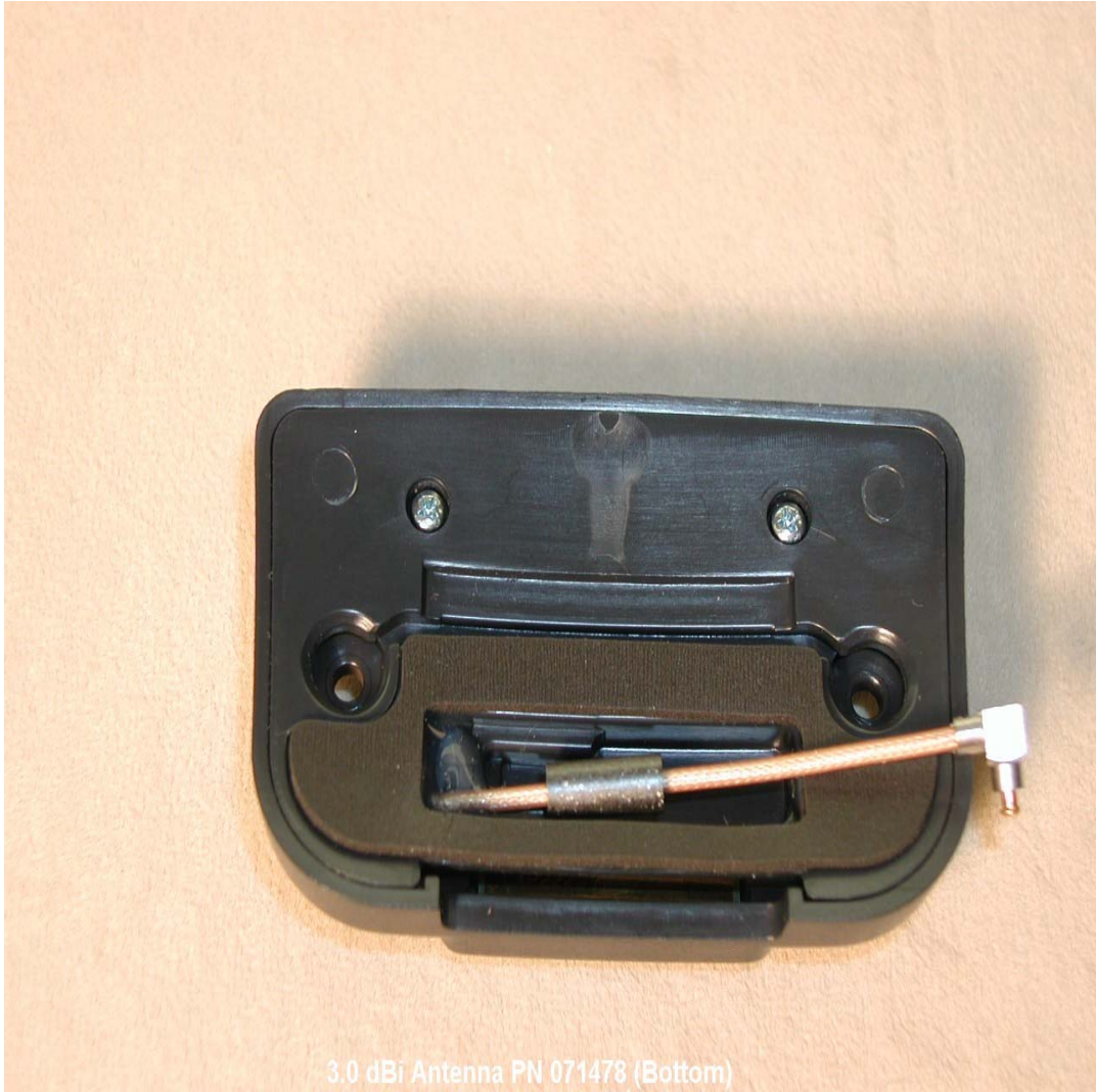
3.0 dBi Antenna PN 071478 (Bottom)