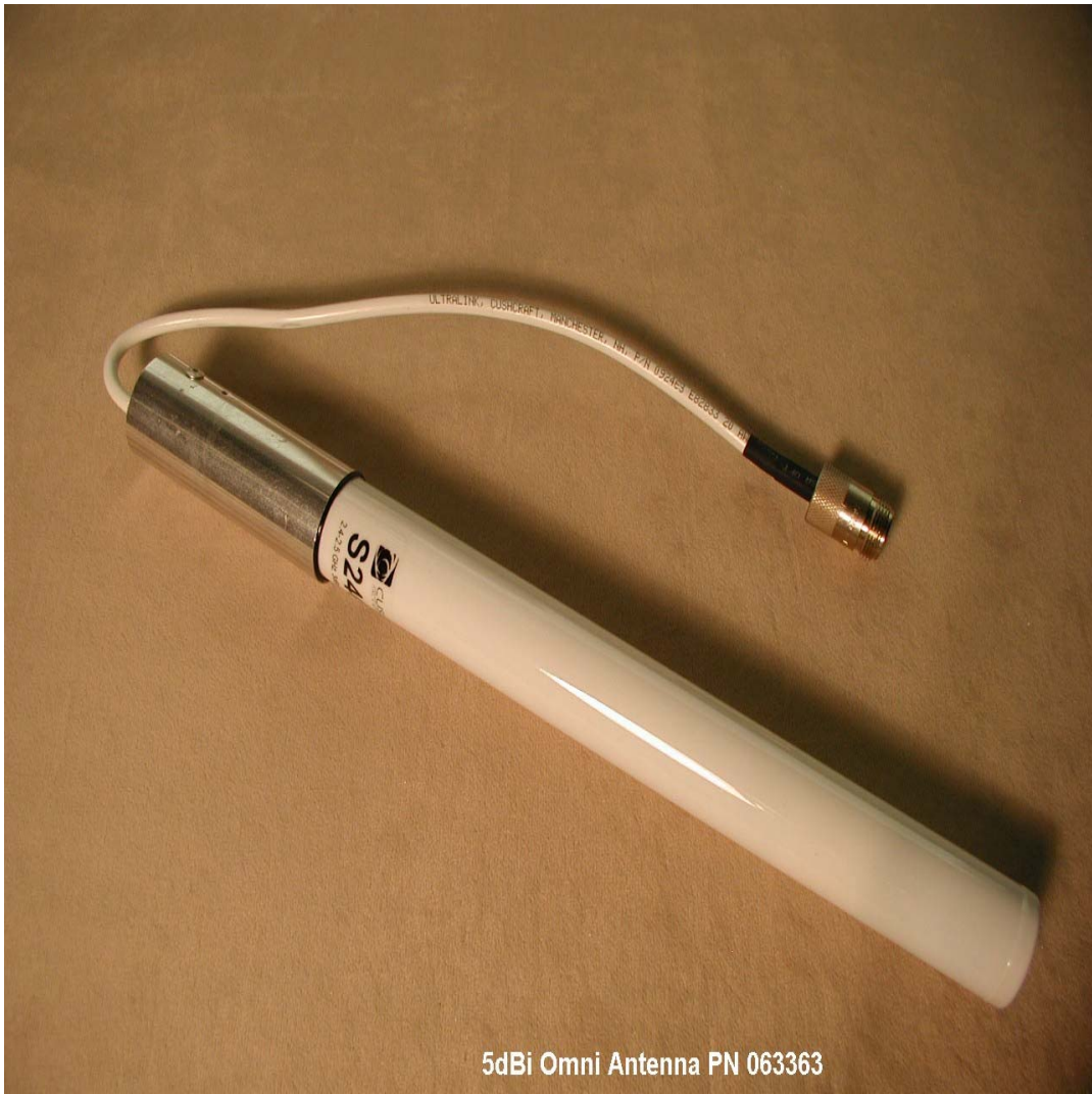
5dBi Omni Antenna PN 063363