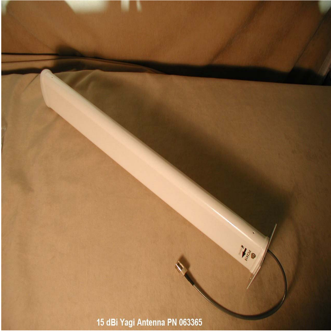
15 dBi Yagi Antenna PN 063365