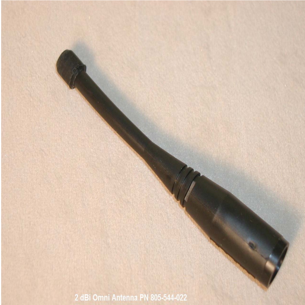
2 dBi Omni Antenna PN 805-544-022