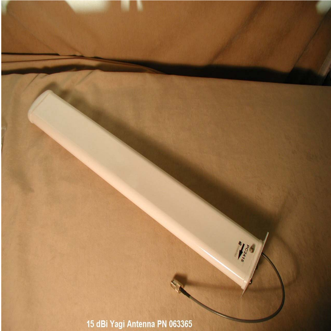
15 dBi Yagi Antenna PN 063365