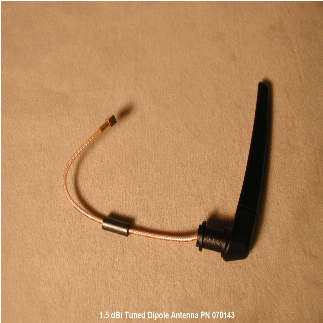
1.5 dBi Tuned Dipole Antenna PN 070143