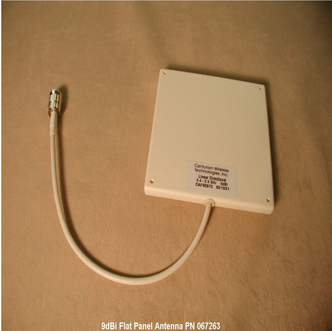
9dBi Flat Panel Antenna PN 067263