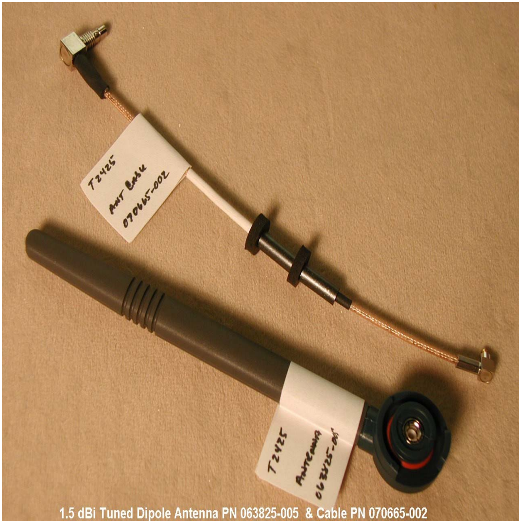
1.5 dBi Tuned Dipole Antenna PN 063825-005 & Cable PN 070665-002