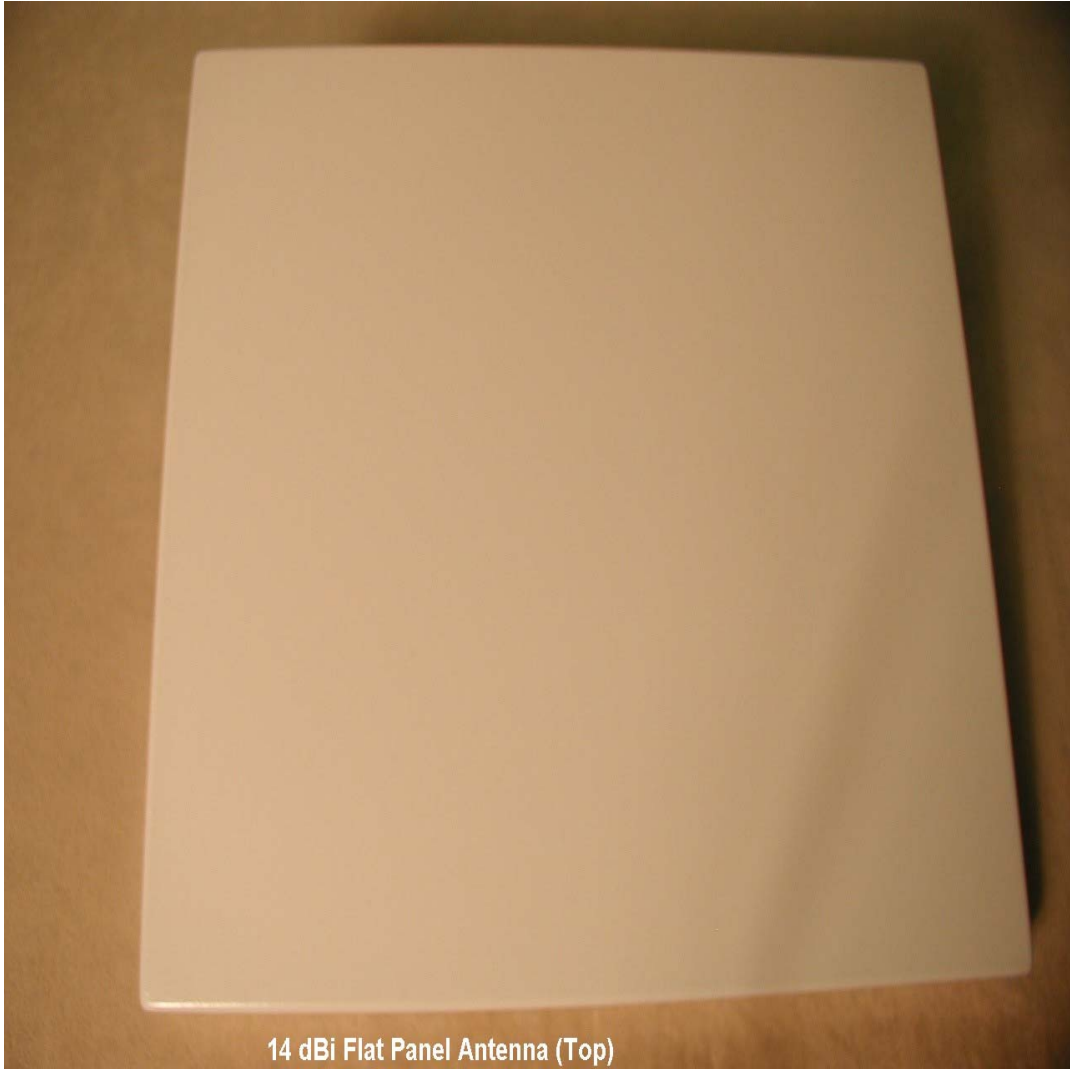
14 dBi Flat Panel Antenna (Top)