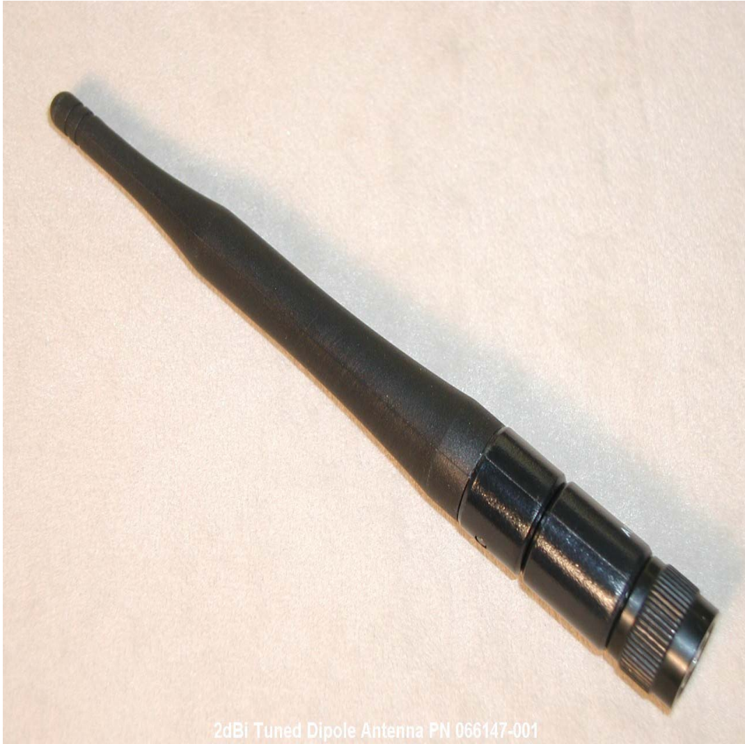
2dBi Tuned Dipole Antenna PN 066147-001