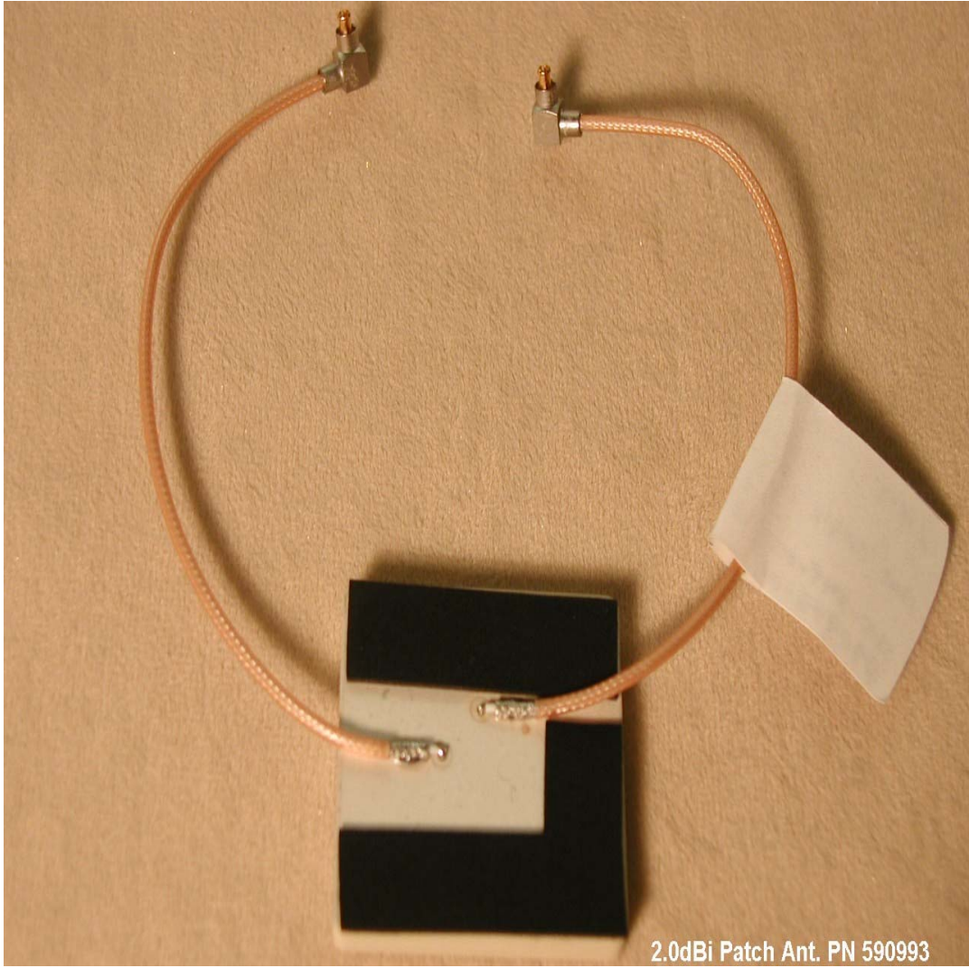
2.0dBi Patch Ant. PN 590993