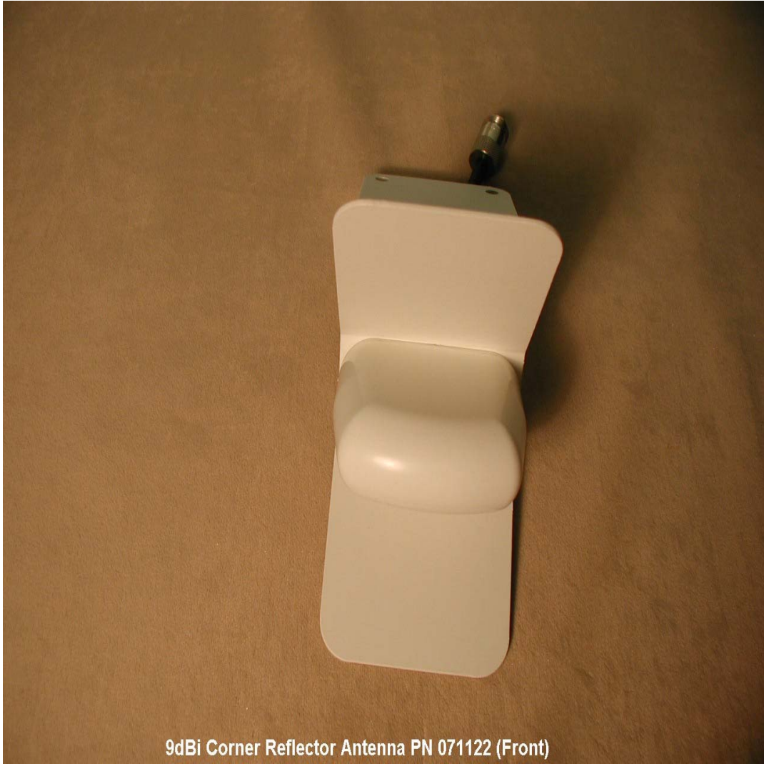
9dBi Corner Reflector Antenna PN 071122 (Front)