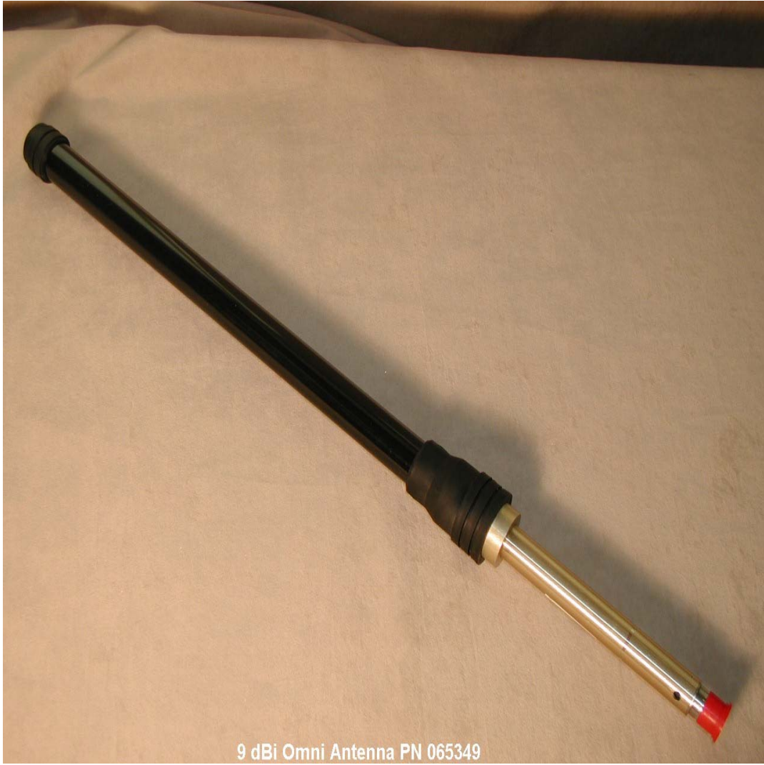
9 dBi Omni Antenna PN 065349