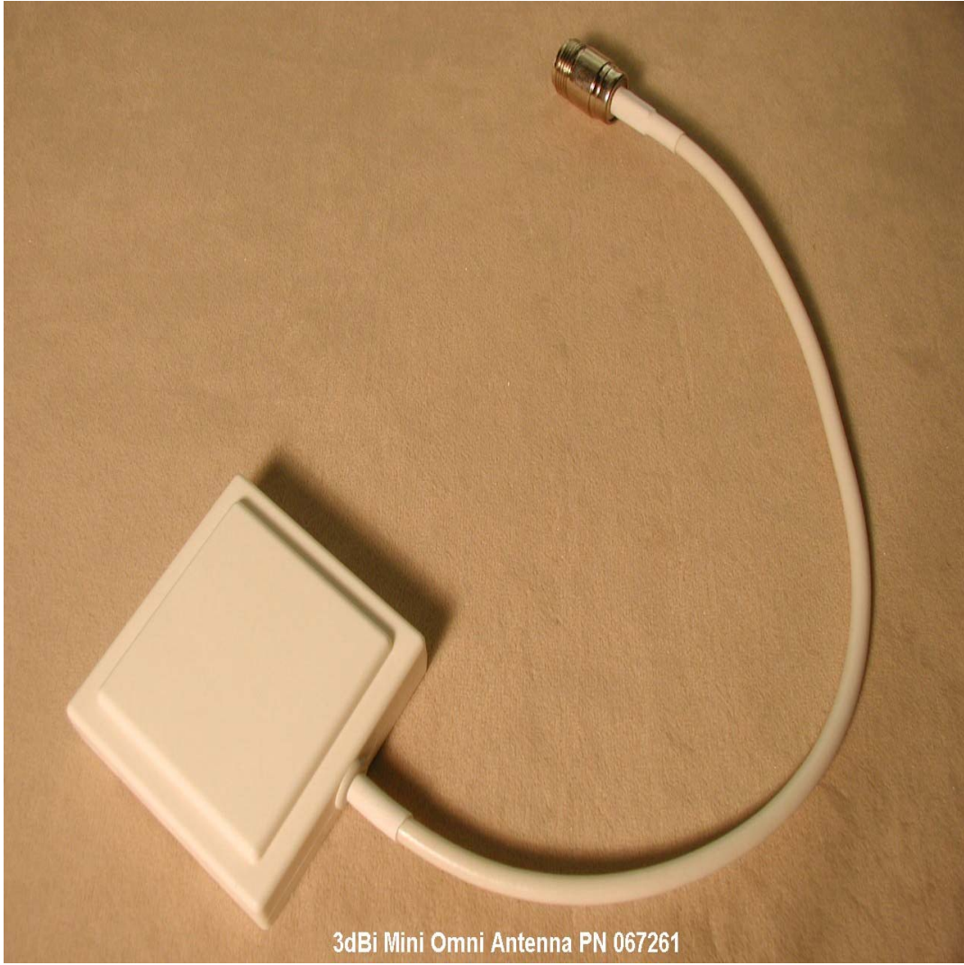
3dBi Mini Omni Antenna PN 067261