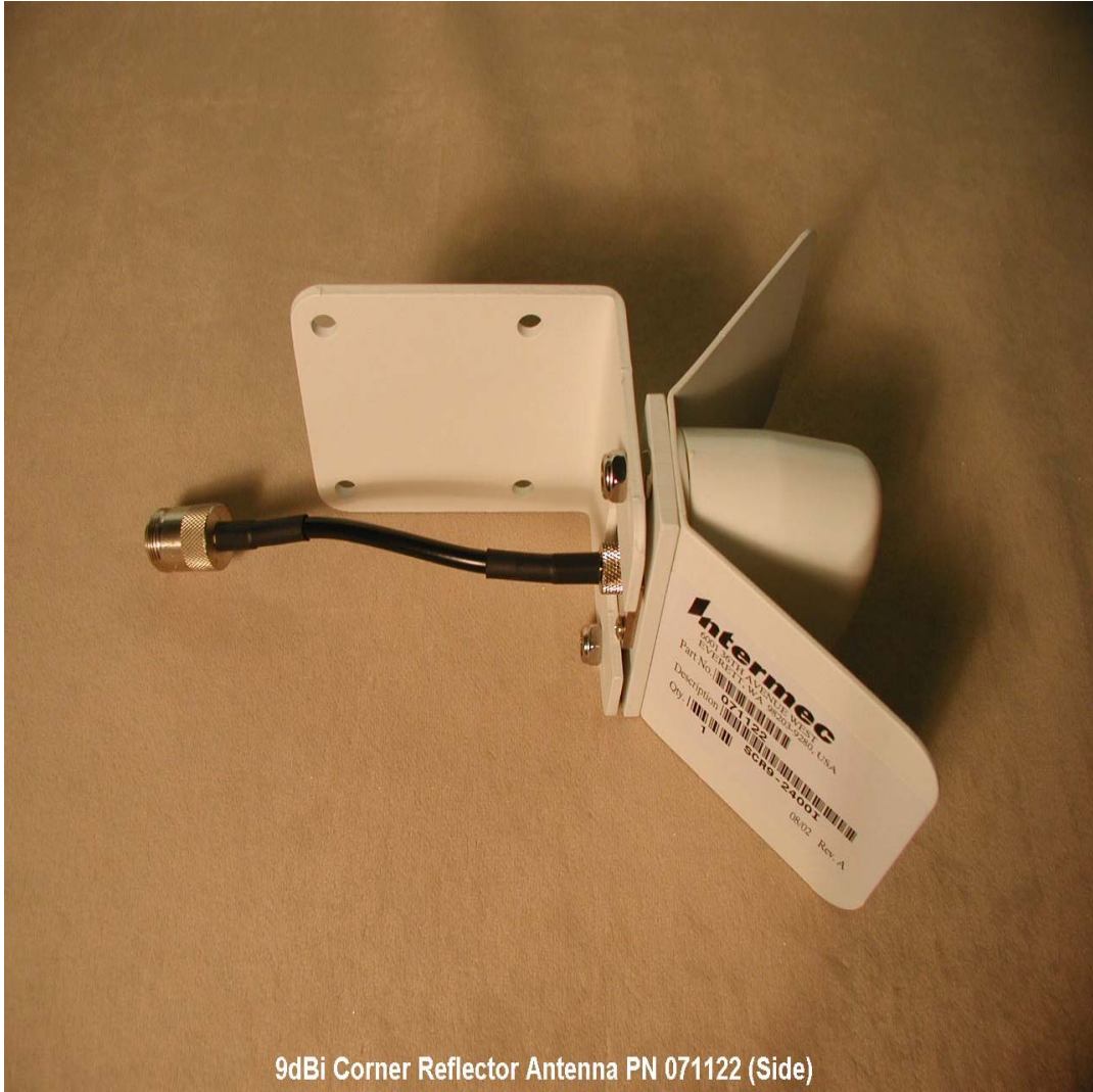
9dBi Corner Reflector Antenna PN 071122 (Side)