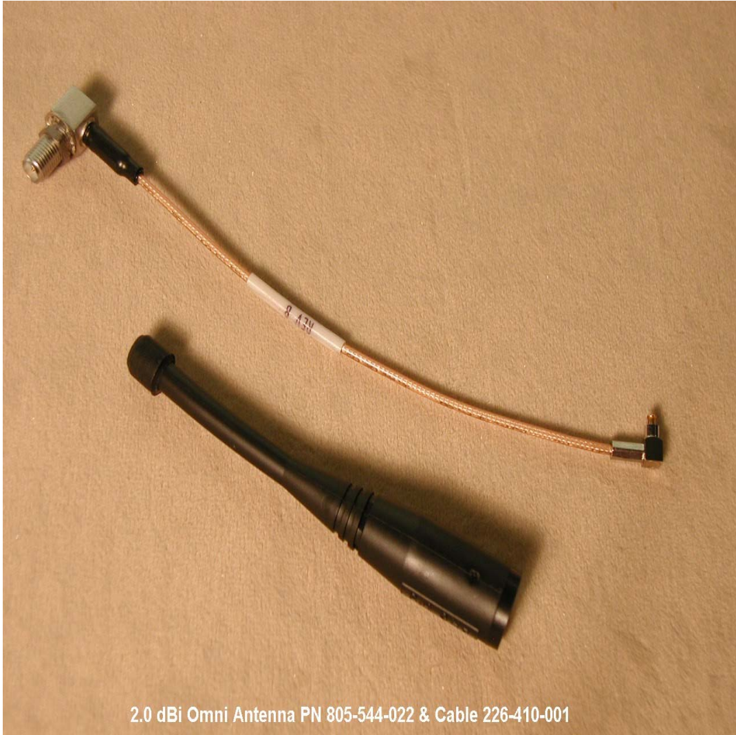
2.0 dBi Omni Antenna PN 805-544-022 & Cable 226-410-001