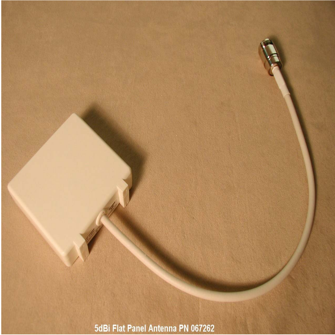
5dBi Flat Panel Antenna PN 067262