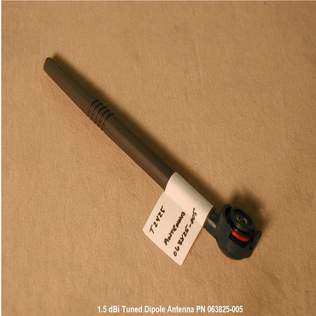
1.5 dBi Tuned Dipole Antenna PN 063825-005