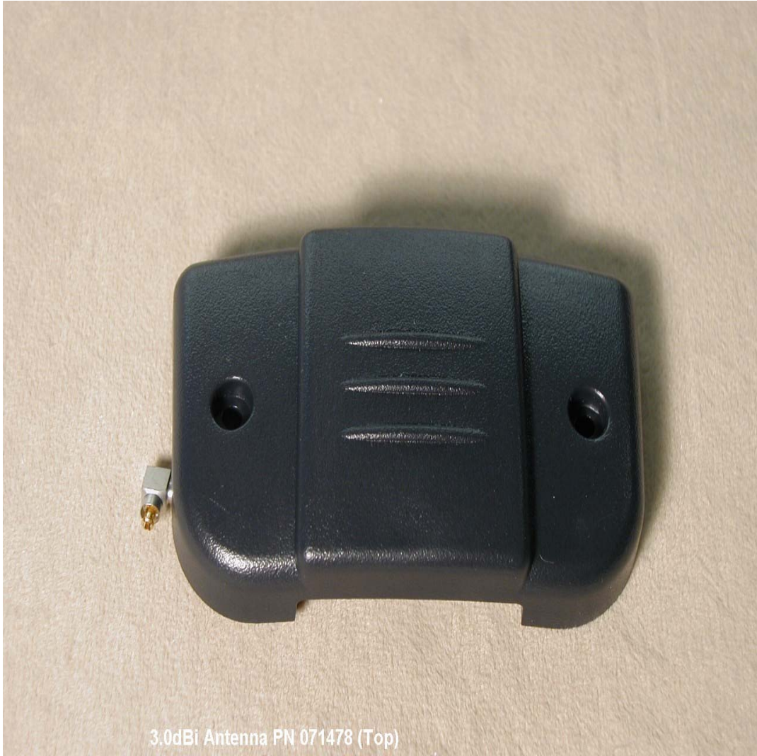
3.0dBi Antenna PN 071478 (Top)