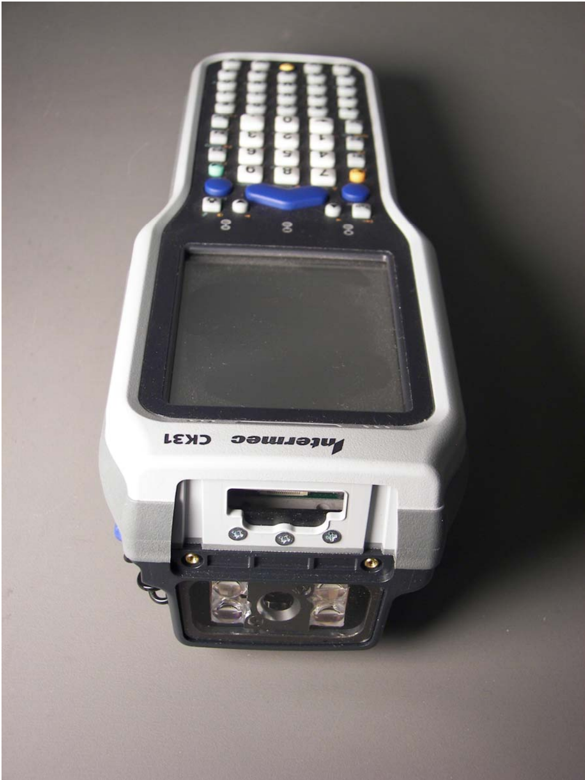
CK31 (Large Back) – top view. SD card cover removed. EX25 scan engine.