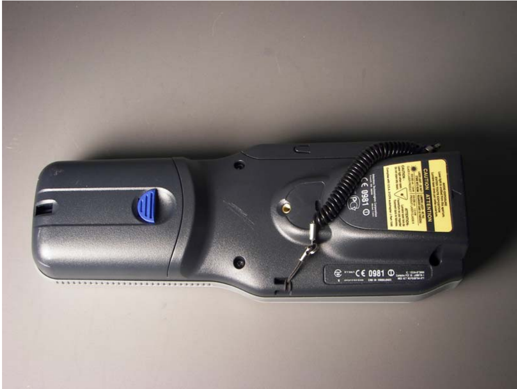
CK31 (Large Back) – back view.