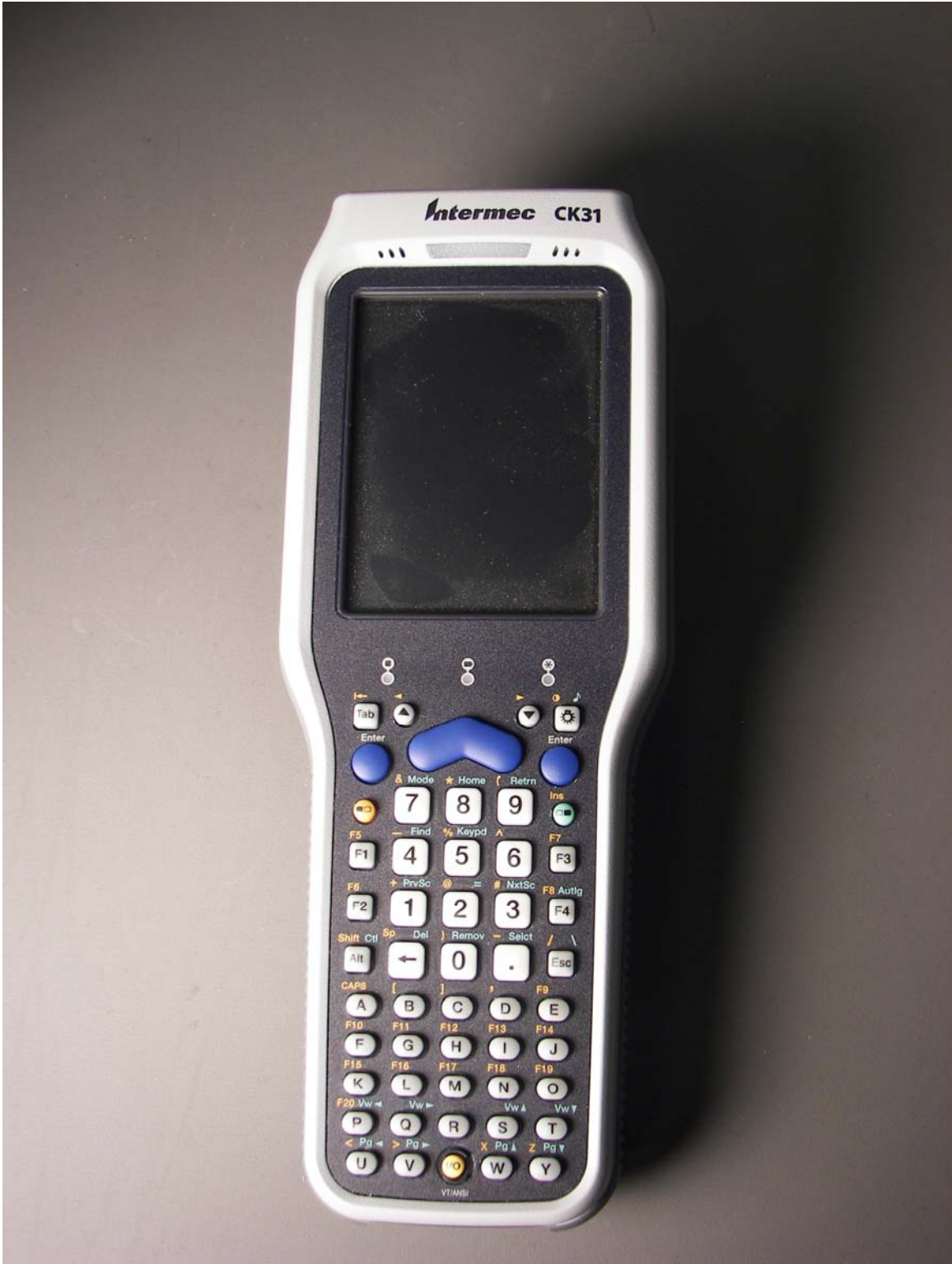
CK31 – front view.