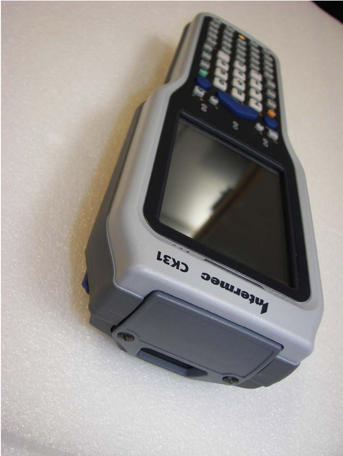
CK31 (Small Back) – top view. SD card cover installed. EV12 scan engine.