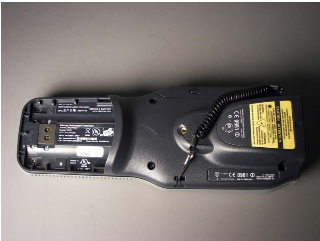
CK31 (Large Back) – back view. Battery removed.