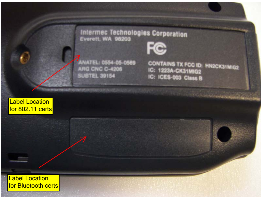
CK31 (Large Back) – back view. Labeling.