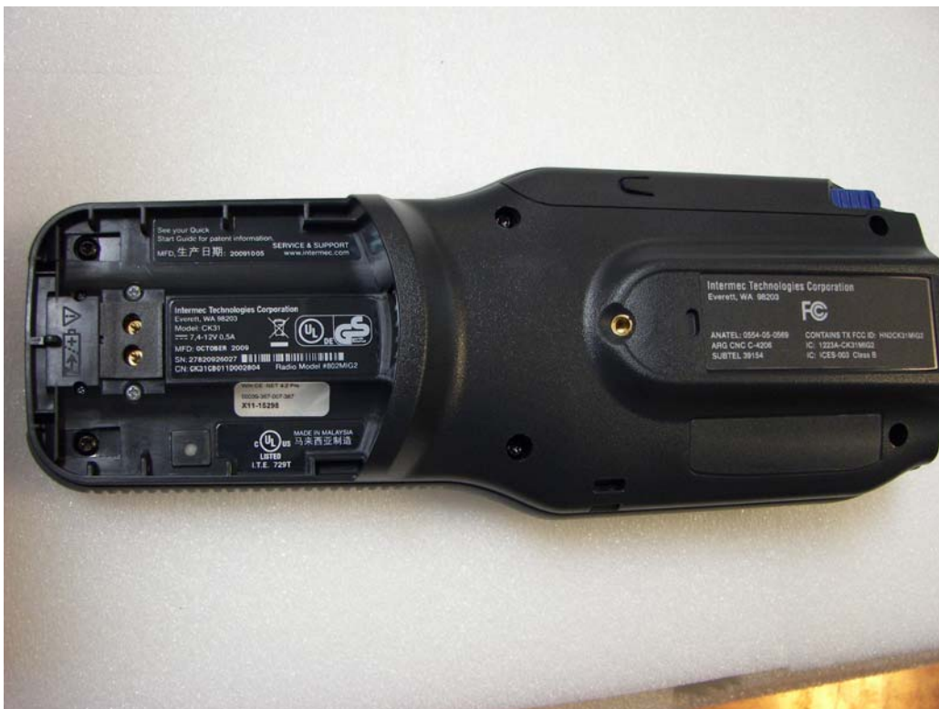
CK31 (Small Back) – back view. Battery removed.