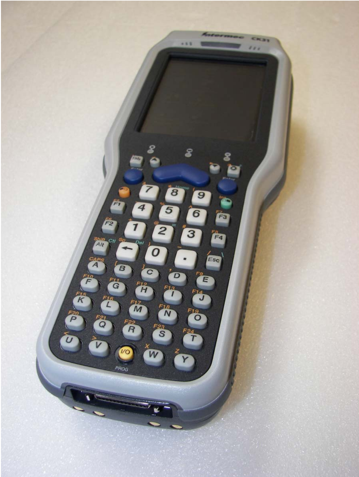
CK31 (Small Back) – bottom view. Shows I/O Connector