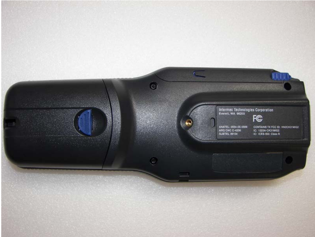
CK31 (Small Back) – back view.