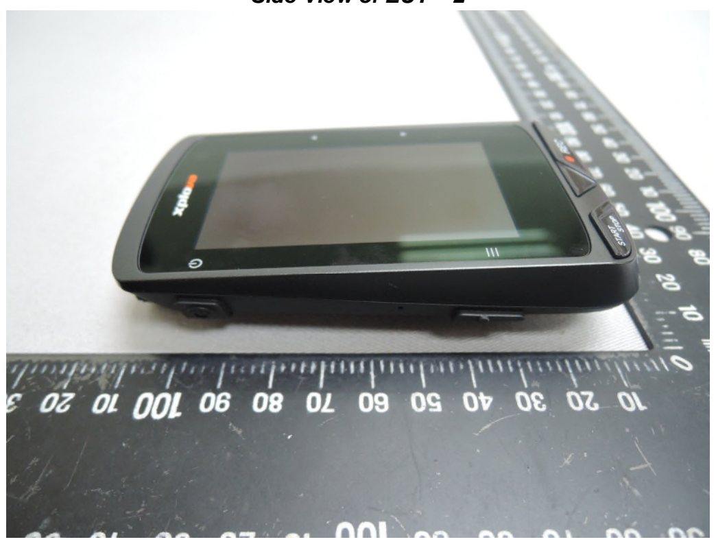
Side View of EUT - 3