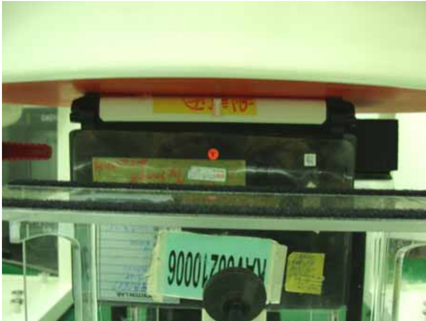
Rear View - Bottom of DUT with Phantom 0cm Gap (GSM/WCDMA Antenna)