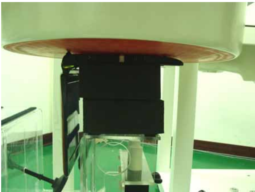
Side View - Bottom of DUT with Phantom 0cm Gap (CDMA2000 Antenna)