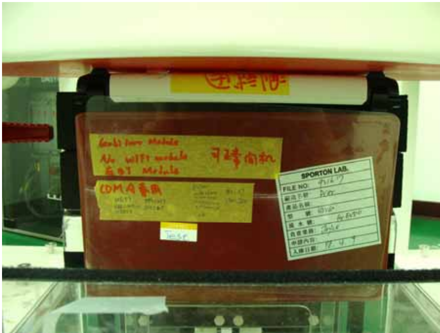
Rear View - Bottom of DUT with Phantom 0cm Gap (CDMA2000 Antenna)