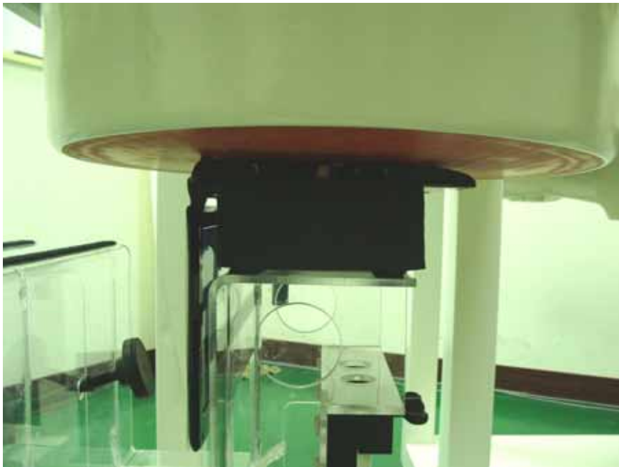
Side View - Bottom of DUT with Phantom 0cm Gap (GSM/WCDMA Antenna)