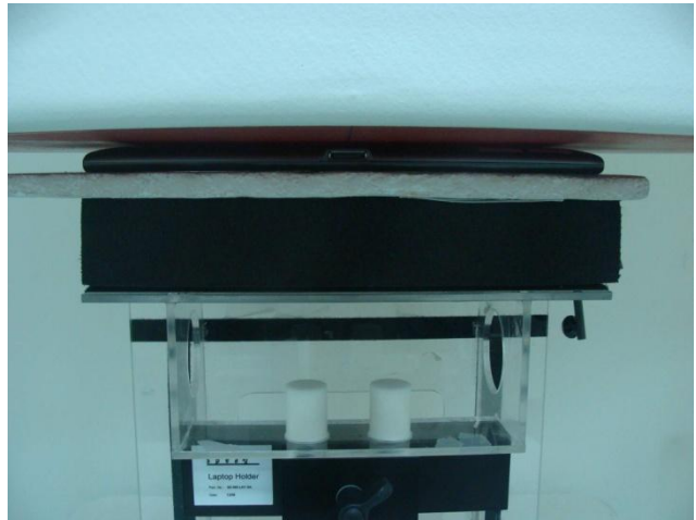
Bottom Face of Tablet with Phantom 0 cm Gap