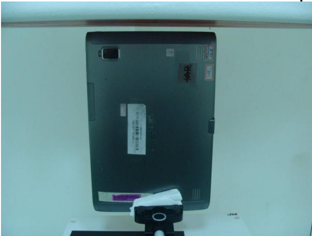
Secondary Portrait with Phantom 0.6 cm Gap