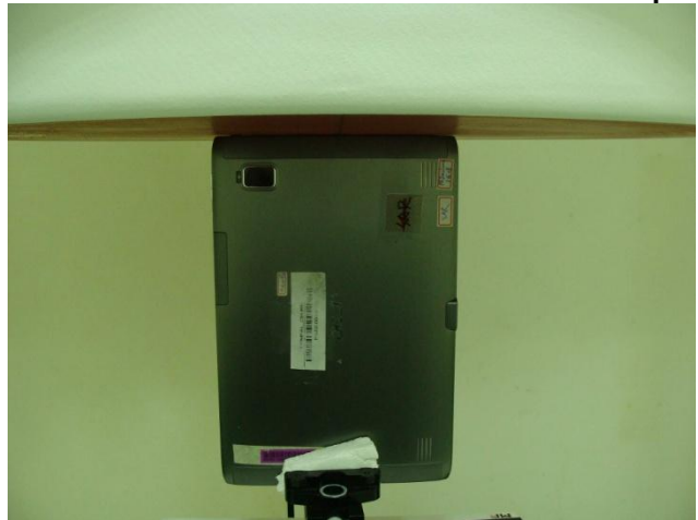
Secondary Portrait with Phantom 0 cm Gap