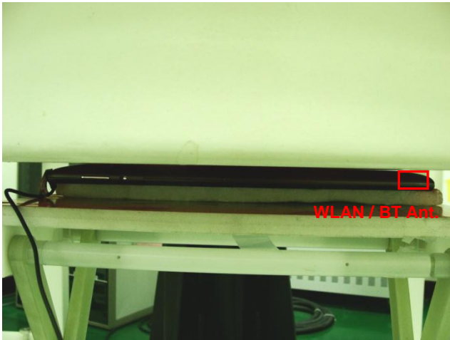
Bottom of the DUT with Phantom 0 cm Gap