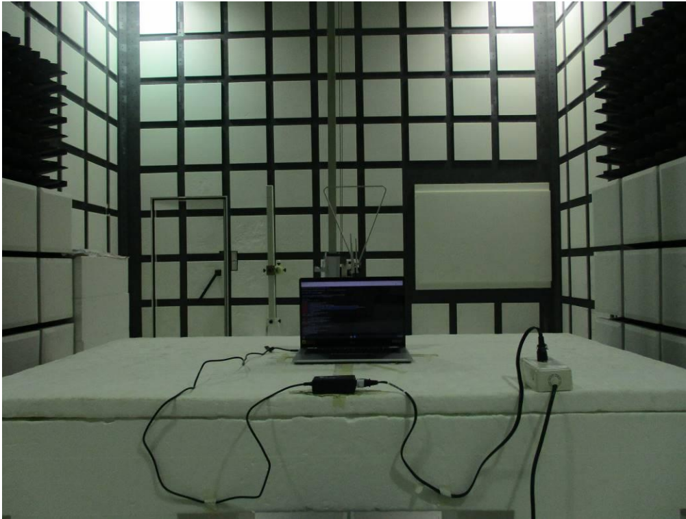
Conducted Setup Photo (Measurement at Antenna Port)