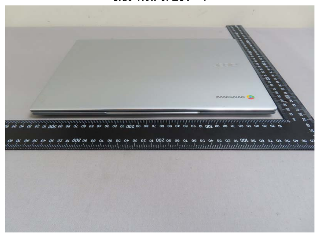
Side View of EUT - 2