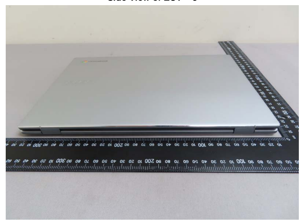
Side View of EUT - 4