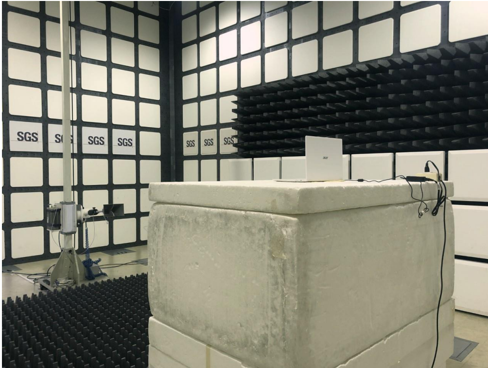
Radiated Emission Set up Photos (Front View)