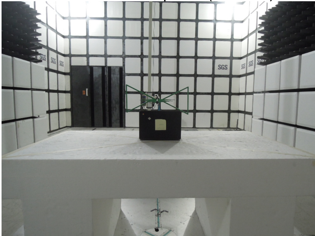
Radiated Emission Set up Photos (Above 1GHz)